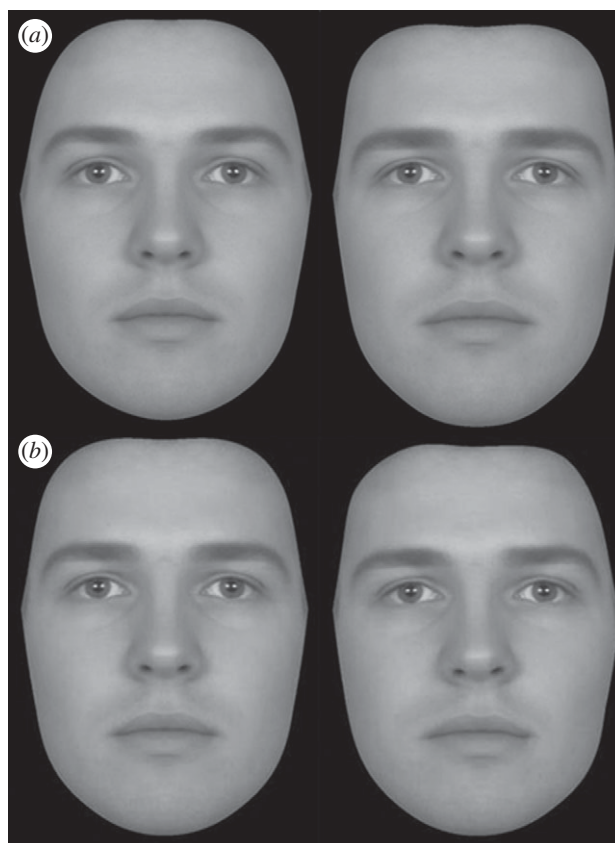
Figure 1. (a) Feminized (left) and masculinized (right) male faces. (b) Symmetric (left) and asymmetric (right) male faces.

To measure preferences for sexually dimorphic features, we used pairs of composite face images. The pairs comprised one masculinized and one feminized version of the same face (figure 1). Images were manufactured from 50 young adult Caucasian male and 50 female photographs. Composite images, composed of multiple images of different individuals, were used as base faces (10 male and 10 female composite images each made of five individual images). The composite images were made by creating an average image made up of five randomly assigned individual facial photographs [19] (this technique has been used to create composite images in previous studies; see [58,59]). Faces were transformed on a sexual dimorphism dimension using the linear difference between a composite of all 50 male faces and a composite of all 50 female faces (following the technique reported by Perrett et al. [20]). Transforms