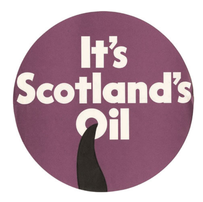
Figure 3: Scotland's Oil: The SNP's campaign to keep a larger share of Scotland's offshore oil was launched in September 1972. This image (SPA/761/4)c. 1973 is provided courtesy of the Scottish Political Archive, University of Stirling, Stirling FK9 4LA.

To date Crawford and Boyle's Opinion offers the most detailed and substantive analysis of Scotland's potential legal status in international law following independence. States are legal entities in international law with the capacity to enter into treaty with other states. For example, when Scotland entered into the Treaty of Union in 1706 with England it did so as an autonomous