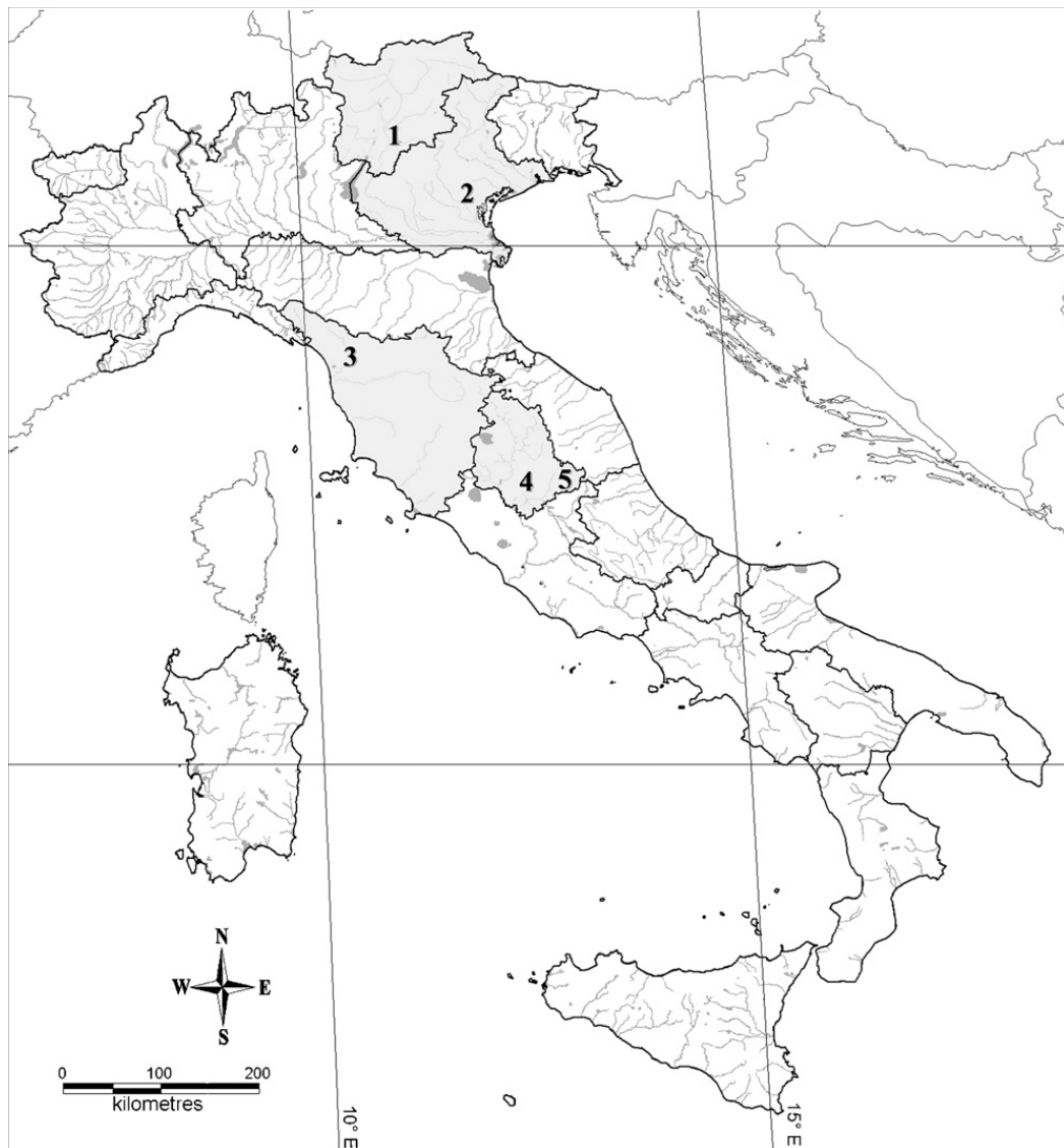
Fig. 1. The location of the rainbow trout farms sampled throughout Italy and found to be positive for Gyrodactylus von Nordmann . (1) Avisio Torrent, Trentino Alto Adige (46°16'42.70"N, 11°26'39.52"E); (2) River Sile, Veneto (45°38'23.18"N, 12°08'14.29"E); (3) River Sérchio, Tuscany (44°02'52.00"N, 10°27'39.74"E); (4) Clitunno Fountain, Umbria (42°44'41.95"N, 12°42'24.81"E); (5) River Nera, Umbria (42°51'41.38"N, 12°58'48.84"E).

were sequenced using the PCR primers only. Amplified fragments of COI were sequenced using the PCR primers in addition to ZMO2 (5'-CCAAAGAACCAAAATAAGTGTG-3') and ZMO3 (5'-TGTCYCTACCAGTGCTAGCCGCTGG-3') (Hansen et al., 2003). Sequences were proofread in VectorNTI (Invitrogen) and identity established by submitting the sequences to a GenBank BlastN search ( http://www.ncbi.nlm.nih.gov/ ) (Altschul et al., 1990; Zhang et al., 2000). Calculation of genetic distances was performed in Mega 4.0 (Tamura et al., 2007).