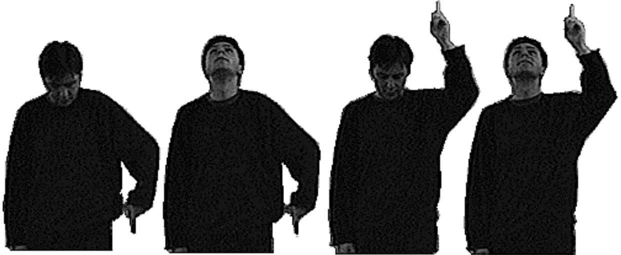
Figure 1. Reproductions of the digitised stimuli used in Experiment 1. These images show agreeing and disagreeing head and gesture cues. Neutral head stimuli are not shown.

approximately 11° of vertical visual angle, and 14° of horizontal visual angle and were viewed by participants seated approximately 0.7 m from a 14 inch colour monitor.