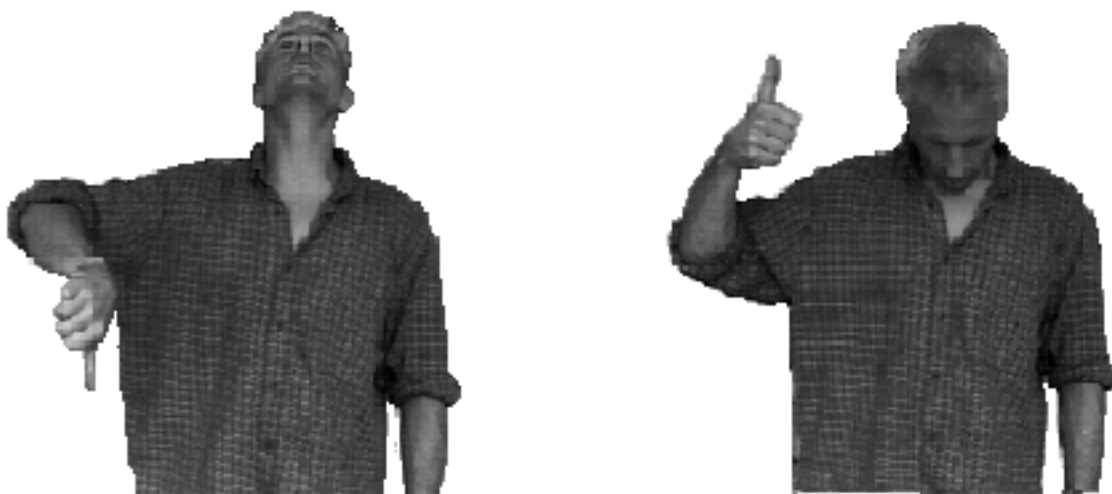
Figure 2. Reproductions of some of the incongruent stimuli used in Experiment 3.

Apparatus and Materials. The visual stimuli consisted of digitised images of an individual making a thumbs-up, or thumbs-down gesture whilst in each case, orienting their head upwards or downwards. Examples of these images are presented in Figure 3. These stimuli subtended approximately 9° of vertical visual angle, and 7° of horizontal visual angle and were viewed by participants seated approximately 0.7 m from a 14 inch colour monitor.