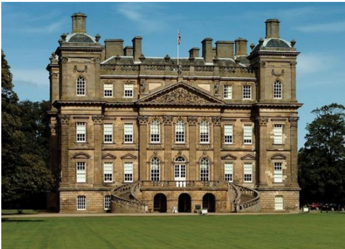
Duff House, Banff

designed the grounds. Lord Frederick Campbell, who was instrumental in the choice of Adam for Register House, Edinburgh, had commissioned work from him for his residences at Ardincaple, Dunbartonshire, and Coombe Bank, Kent. 73