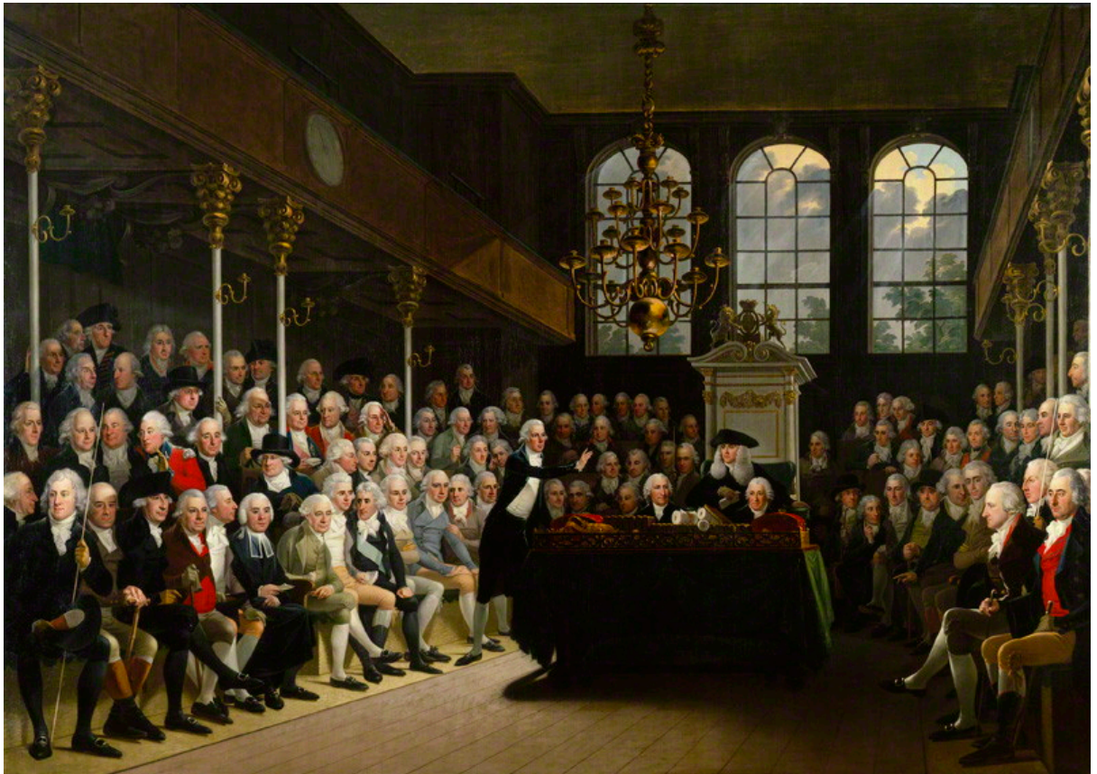
The House of Commons, 1793-4

did so, and how they perceived their roles in parliament will be addressed in subsequent chapters.