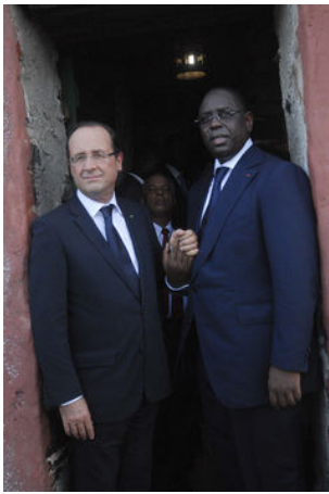
Hollande and Senegalese president Macky Sall in 2012.