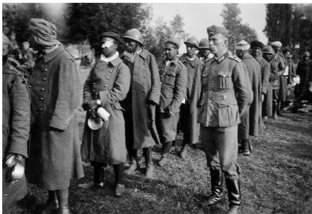
Missing: Senegalese Tirailleurs, 1940.

Since 2013, March 19 has marked France's annual day of commemoration for those killed in the Algerian war of independence as well as the more minor conflicts in Morocco and Tunisia. But on the day that France commemorates those who died in its wars of decolonisation in North Africa, the truth about a massacre of sub-Saharan soldiers who fought on its side in World War II must also be acknowledged.