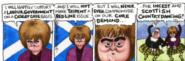
Steve Bell, The Guardian, 9 March 2015

The same problem of partisanship clouding important cross-party issues might be identified in the reaction to the use of two misguided references to make political points. One was Guardian cartoonist Steve Bell's reference to an obscure "incest and folk dancing" quotation to (I think) lampoon the SNP's desire to demand more than Labour can offer in any coalition deal. It was heavily attacked on Twitter in Scotland.