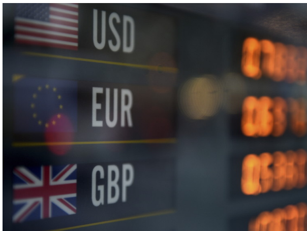
Markets are down.