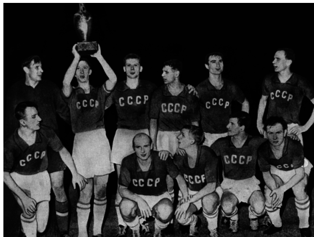
Soviet celebrations in 1960.

Like previous tournaments Euro 2016 will involve a group stage with four teams per group – the difference is that there will now be six groups instead of four. The best 16 teams will go through to three rounds of knockout stages ahead of the final.