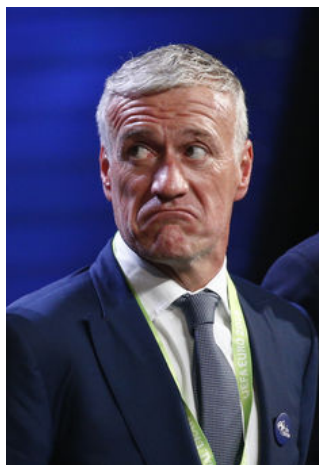
French coach Didier Deschamps.

Either way, UEFA has set the scene for a more thrilling tournament than the previous ones – not least because the four most successful third-placed teams will be going through to the knockout stages. That should help ensure a more intense and competitive tournament, that keeps fans gripped through June and early July.