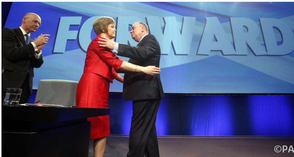
Scotland next first minister looks set to be a coronation.

I was asked about three times this week by journalists covering the referendum whether David Cameron would have to resign in the event of a Yes vote. Nobody asked me about Alex Salmond. But when you lose the big one, somebody has to be responsible. Not only that, Salmond wouldn't have had a great time at first minister's questions after this. It would always be about the referendum. It would have been a stick with which to beat him, and stop his party or the independence movement from putting this week's events behind them.