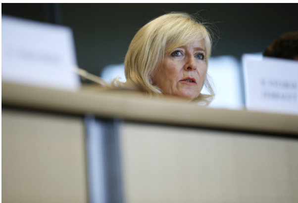
Agent for change: EU Ombudsman Emily O'Reilly

With little fanfare the European Ombudsman, Emily O'Reilly, last week issued a recommendation to the European Commission to make its expert groups more balanced and transparent, having launched an inquiry into the subject last May. Expert groups are little known outside the Brussels bubble, but play an important advisory role.