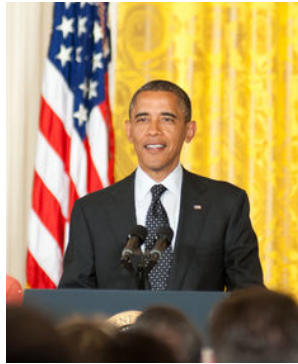
Obama: tough talk.

The UK will need to renegotiate all of these agreements. It is unclear whether this will be feasible, how long it will take and what terms will result. Barack Obama, for one, has indicated that the US would not negotiate such a deal with the UK, though there have also been warmer noises from other Americans.