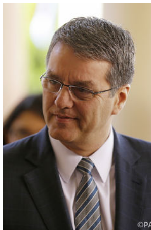
Roberto Azevedo.

Russia's recent accession negotiation took 20 years, while China's took 15. Further complicating matters is the WTO's fractious environment – the Doha Round of trade talks has broken down in repeated stalemate since 2001. The consensus-based process means it takes very little to impede an argument, and the UK will have to negotiate terms with, and gain the assent of, all 161 other WTO members.