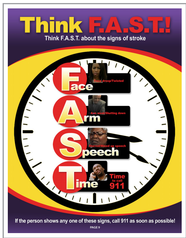
Figure 1. Stroke Ready workbook.

and featured dancing by the academic and community partners. The music video included a strong focus on self-efficacy by asking viewers to participate in demonstrating stroke signs. All materials were reviewed by community