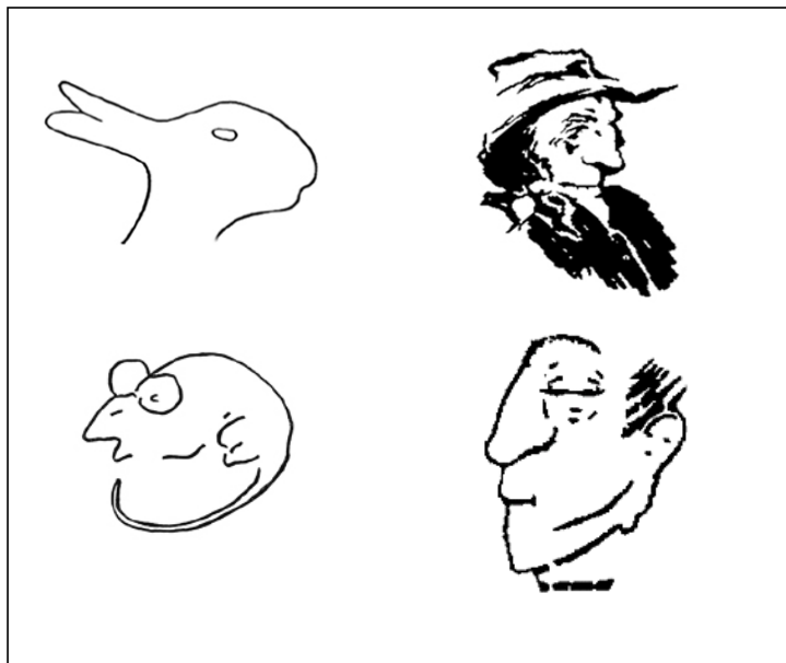
Figure 1. AFs used in Experiment 2 (clockwise from top-left: duck/rabbit, cowboy/Indian, face/mother, man/mouse).