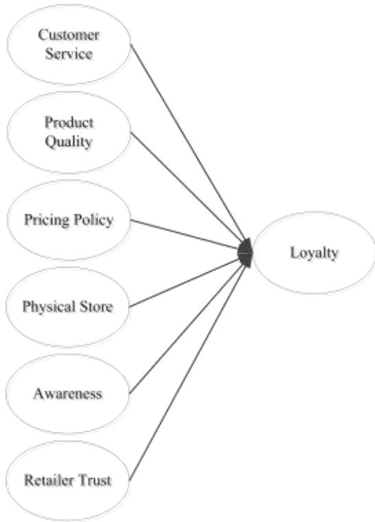
Figure 1: The conceptual diagram of model 1.