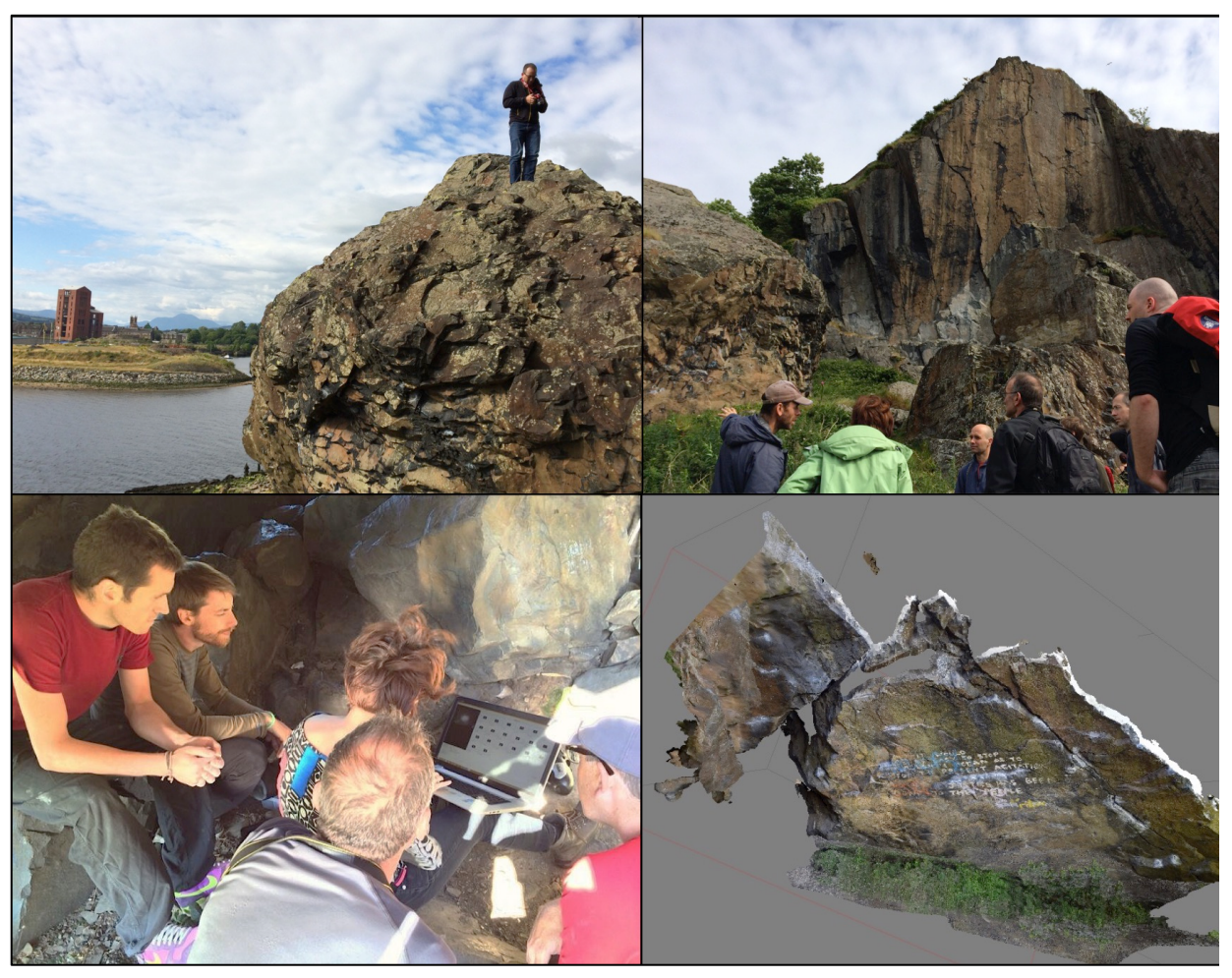
Figure 5: ACCORD work in progress with the climbers at Dumbarton Rock ('Dumby'). Clockwise from top left: (a) taking photographs of one of the boulders for photogrammetry; (b) co-design in action; (c) a photogrammetric model of Pongo boulder; (d) processing images in the field.

Importantly, the act of participating in the production of 3D visualisations was a significant aspect of people's responses to the models, contributing to a sense of authenticity. The significance of 'being there' was summed up particularly succinctly by one participant in the Uist group who simply stated, 'it's authentic because we made it'. For some, the authenticity of the model was also derived from pre-existing forms of attachment and identity associated with the site they were recording and modelling. As discussed in the previous section, these visualisation practices were undertaken in landscapes that are rich in significance and the focus of existing heritage practices, and this in turn clearly contributed not just to the value of the resulting models, but also their authenticity. Thus, in the context of co-production, the productive nature of 3D models, and the significance of who creates them with what intention, is brought into sharp focus, creating forms of authority and aura.