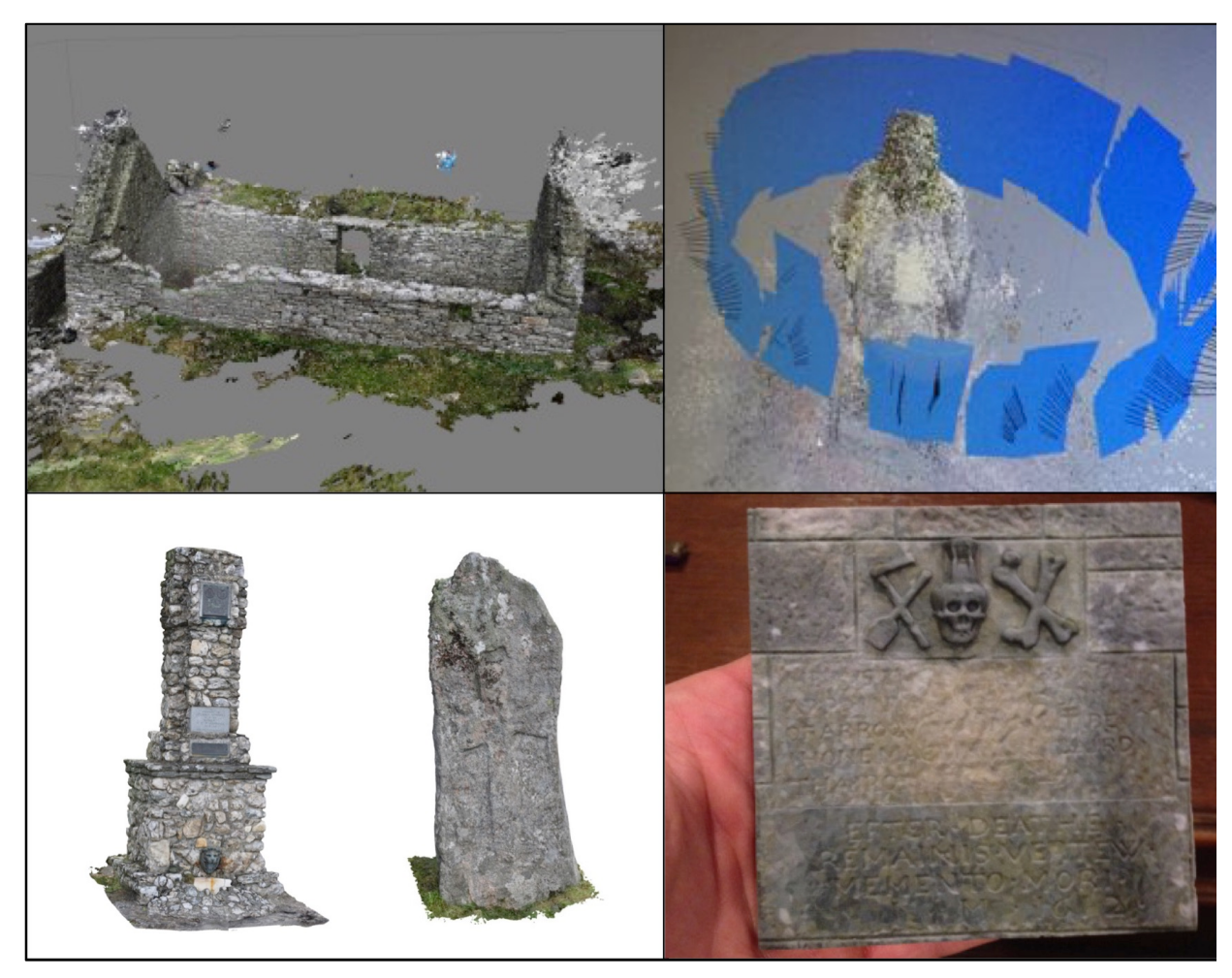
Figure 4: Some examples of ACCORD outputs in various stages of production. Clockwise from top left: (a) processing of a photogrammetric model of Cullingsburgh Manse; (b) point cloud of Falstaff showing camera positions; (c) 3D print of the MacFarlane plaque at Luss church courtesy of Preston McFarland; (d) photogrammetric visualisations of the WW1 memorial in Colintraive and the early medieval cross at Camas Nan Geall, Ardnamurchan (Images: ACCORD, CC-BY).

as an iconic monument, distinguishing the Uists from other islands in the Outer Hebridean archipelago, as well as the rest of Scotland. Dumbarton Rock, or 'Dumby', has an iconic role in Scottish climbing heritage, symbolic of a gritty urban scene (see Hale et al. 2017, 9 and 12). As a final contrasting example, Kenny Hunter's King of the Castle Sculpture, created as part of a public art regeneration project in 1999, is symbolic of the resilience and spirit that characterise the Castlemilk community.