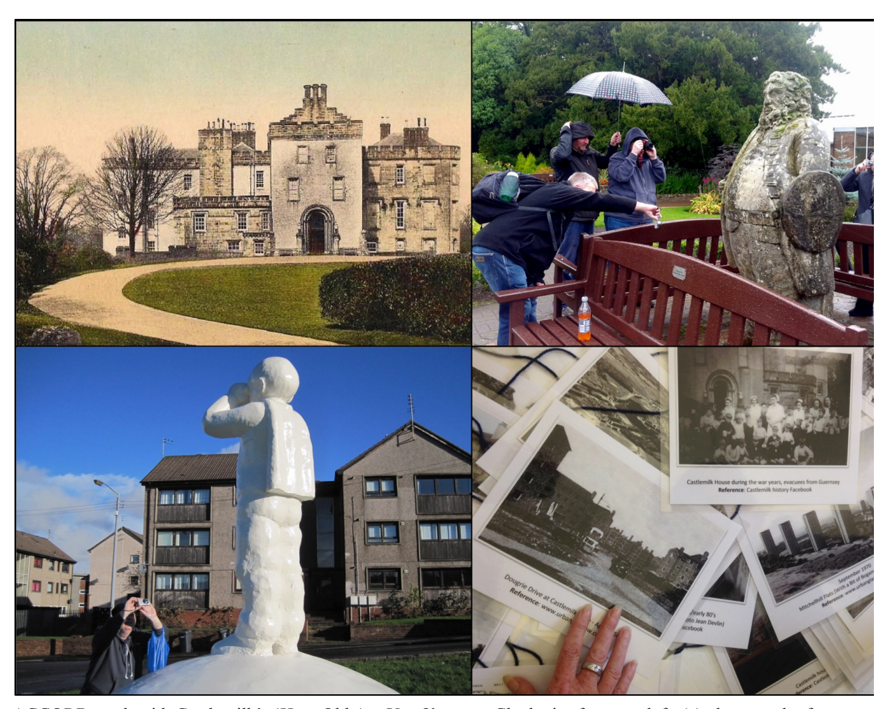
ACCORD work with Castlemilk's 'How Old Are Yew?' group. Clockwise from top left: (a) photograph of Castlemilk House as pictured on an Edwardian postcard; (b) recording the statue of Falstaff; (c) old photographs of Castlemilk collected by the group; (d) a member of the group taking photographs of Kenny Hunter's sculpture, 'King of the Castle', for photogrammetry.

to articulate and authorise relations between objects and places. For instance in recording and modelling a nineteenth-century garden statue of Falstaff (Fig 6), which is now located in Calderwood Park, the Castlemilk group were driven by a concern to reconnect the statue with its original location in the grounds of Castlemilk House. Their selection of the statue in the context of co-design was framed by previous research on the house and its grounds, in particular an historic postcard showing Falstaff standing in the gardens. Talk of requesting his physical return to Castlemilk, was transposed into the possibility of a metaphorical reappropriation through recording and modelling.