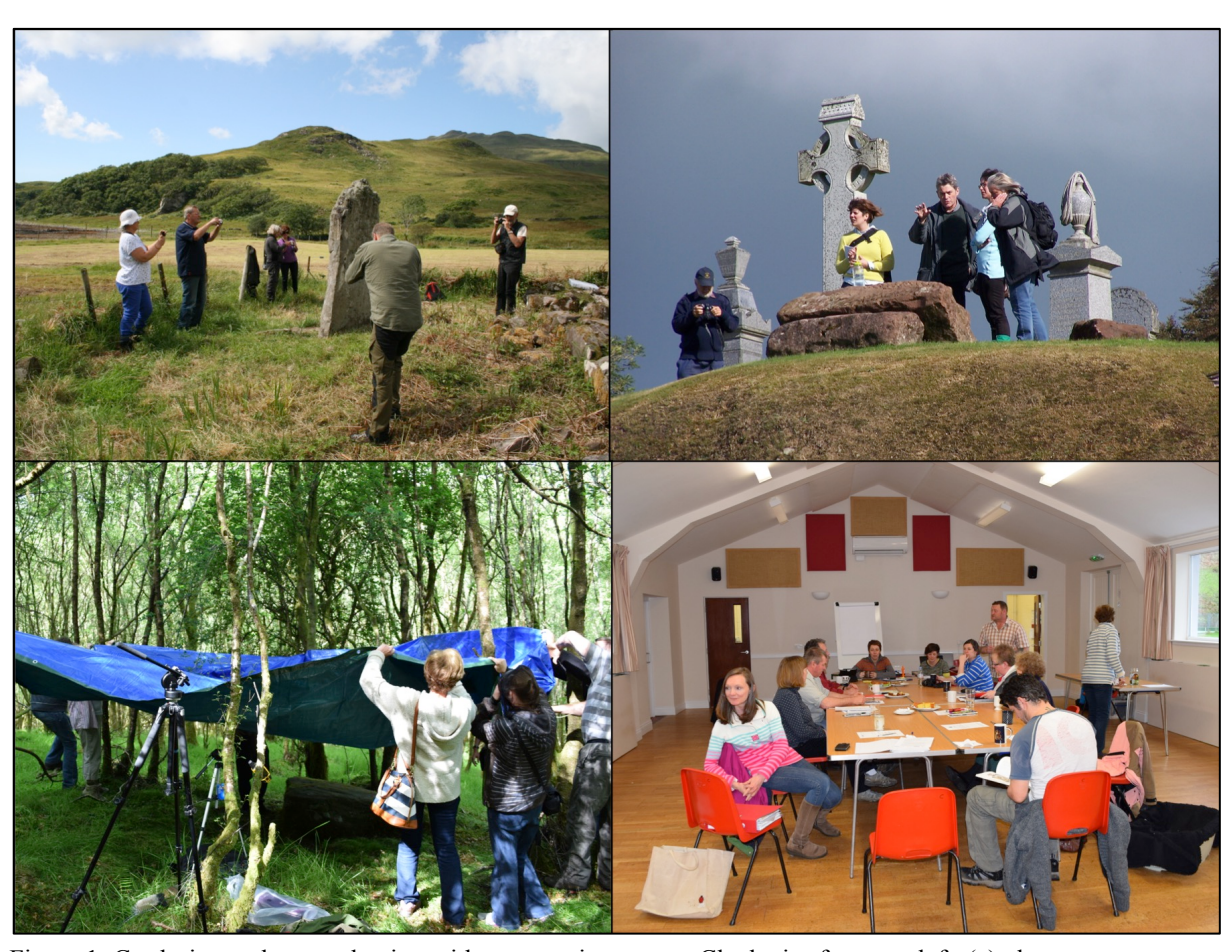
Figure 1: Co-design and co-production with community groups. Clockwise from top left: (a) photogrammetry with Ardnamurchan Community Archaeology Group; (b) co-design with Kirkcudbright Historical Society; (c) RTI and (d) focused group interview, both with and Colintraive and Glendaruel History and Archaeology Group (Images: ACCORD, CC-BY).

(http://archaeologydataservice.ac.uk/archives/view/accord_ahrc_2015/overview.cfm)