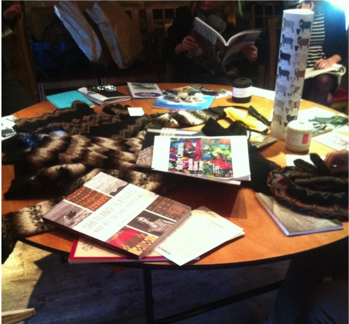
Figure 1- Material artefacts shared at the Gathering at Brodie Castle, September 2015

At the September gathering GSA reviewed possible approaches to enlightened evaluation with the help of a range of experts. Focusing on the CFP projects underway and using the material artefacts gathered on trips to the Western Isles and Shetland as well as other activities, participants reflected on the journey taken so far and shared their experiences. At the second 'major' November meeting HIE and GSA met 'en masse' to consider Harmonics for the first time. The work concentrated on: what had been the experience of HIE and GSA staff of the partnership to date; and, what preferable futures might be springing from the partnership. GSA and HIE people participated with frank and enthusiastic engagement and energy for the partnership was high. A clear question was foregrounded by participants: What is the 'partnership space', as opposed to GSA and HIE spaces? As one participant described "There is a huge amount of creativity in both organisations and it's how we join forces and meld that creativity for the wider socio and economic development of the Highlands and Islands".