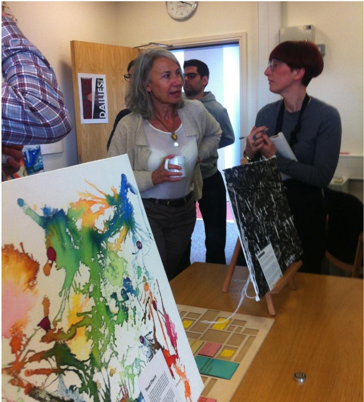
Figure 3. Discussion amongst work 'in the making', Moray, March 2016

The second set of Dailies were held in July and included representation from the PGT and PGR student cohort. As well as members of the research cohort of PhD and MRES candidates, MDES students gave presentations about their group projects, which began in January 2015. A representative from the programme discussed her team's project, Bike Hub, sparking wide interest from the audience. Bike Hub proposes the creation of a series of shelters throughout Barra. Young people would be encouraged to take ownership of the Bike Hubs and decide what they are used for. Inspired by interviews with young people and Barra Youth Café, the suggestion from the MDES students is that they could become maker spaces or meeting places. The team of three was given the theme of environmental design and the topic of health and wellbeing during Winter School. During their research the group decided to focus on Barra and became interested in how wellbeing was linked to creativity and having a good relationship with place and landscape. Field research