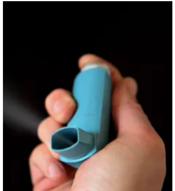
Salbutamol is a drug used to treat asthma.

There are many ways in which an unscrupulous and determined athlete can exploit the TUE process. An obvious strategy is to find a doctor willing to bend the rules and write prescriptions for unnecessary medicines. Another might be to fake an illness or manipulate the results of diagnostic tests.