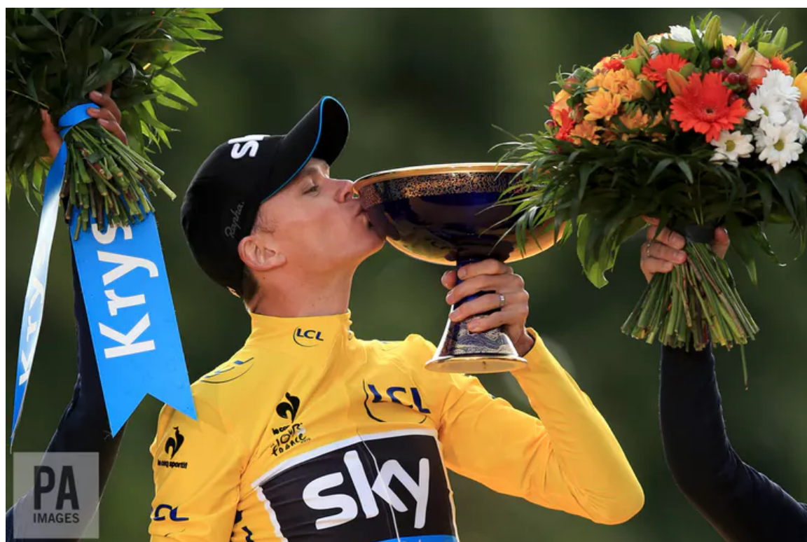
British cyclist Chris Froome celebrates winning the Tour de France in 2015.