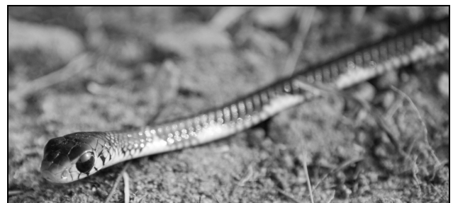
Figure 6. Live subadult Pseudohaje goldii near Nyonié, Estuaire Province, Gabon.

A young individual, about 1.1 m long (Figure 6), was observed at