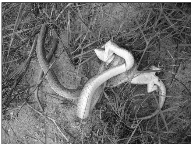
Figure 7. Live adult Psammophis cf. phillipsii preying on an adult Gerrhosaurus nigrolineatus in Vera Plains, Ogooué-Maritime Prov., Gabon.

MSNS Rept 221: Ipassa, Ivindo NP, Ogooué-Ivindo Prov., 18 June 2016. Found at 9:30 A.M. in the leaf litter near the water pump of the research station. Round pupil. SRR: from 19 to 17 by fusion of rows 3 & 4 at V 76 / 74, from 17 to 15 by fusion of rows 2 & 3 at V 117 / 103. Temporal formula 1 + 2 / 1 + 2. Two pairs of sublinguals. Fast to attempt escape and repeatedly bit