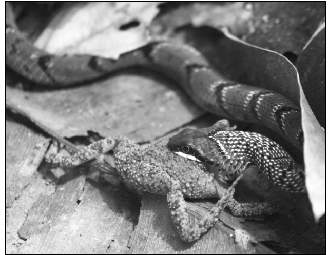
Figure 10. Adult Causus lichtensteinii preying on a Sclerophrys toad in Lopé National Park, central Gabon.

One adult individual observed by one of us (PC) on 10 April 2010 while it was swimming in Ivindo River at 8:10 A.M. near the