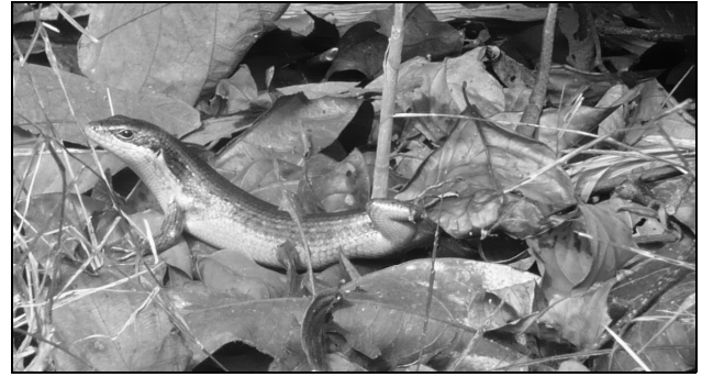
Figure 2. Live Trachylepis p. polytropis on Bende Islet, Ndogo Lagoon, Ogooué-Maritime Prov., Gabon.

rows of dorsal tubercles at midbody; tubercles of the lowest row similar to the others; 36 rows of ventral scales between ventrolateral folds. Patch of enlarged preloacal scales; no enlarged femoral scales; no femoral or preloacal pores. Subcaudals strongly enlarged. Fingers and toes unwebbed. No lateral spiny scales on tail. New locality record. Panzera (2011) presented a photograph of a bird holding a gecko tail in its beak; neither species is identified in the caption, but they are respectively Pycnonotus barbatus (Pycnonotidae) and an adult Hemidactylus mabouia (S. Panzera, pers. comm. to OSGP and PC, 2016). They were photographed in the early morning of 18 February 2011 at Hôtel Tropicana along the beach in Libreville; after a long pursuit of the gecko, the bird got only its tail to eat (S. Panzera, pers. comm.).