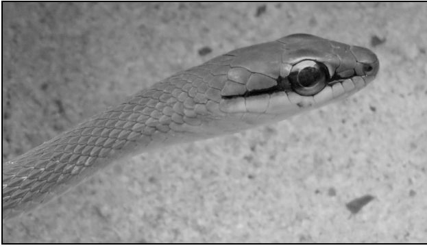
Figure 4. Live adult Hapsidophrys smaragdinus at Hôtel Masuku in Franceville, Haut-Ogooué Province, southeastern Gabon.

surface of its tail is the same as that of its belly; for additional characters see Table 1. New prov. record (Pauwels et al., 2002b; Pauwels and Vande weghe, 2008). We report here an additional specimen from Ipassa, where the species can be regarded as common (Carlino and Pauwels, 2015): MSNS Rept 225, caught on 14 June 2016 at 11 P.M. while it was crossing a path in secondary forest near the station; its SRR from 17 to 15 occurs above V 130 (left) and 135 (right) by fusion of rows 3 and 4, and from 15 to 13 above V 136 by fusion of both paravertebral rows with the vertebral row; temporal formula 1 + 2 (left) / 1 + 1 + 2 (right).