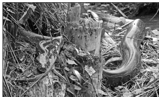
Figure 8. Live adult Python sebae in Nyonié, Estuaire Province, Gabon.

MSNS Rept 230: 800 m North of Hôtel Tropicana, Quartier Tahiti, Libreville, Estuaire Prov., 14 March 2012. Found at 6:48