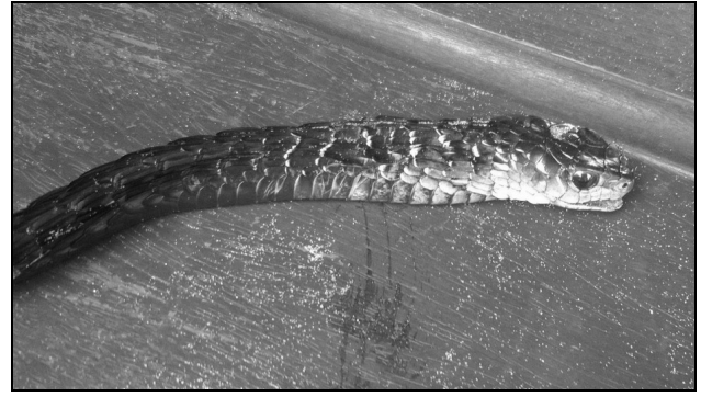
Figure 5. Freshly killed Thrasops flavigularis at Pointe Denis, Estuaire Province, Gabon.

MNHN-RA 2014.0063: Mandji, about 10 km SW of Koulamoutou, Lolo-Bouenguïdi Dept, Ogooué-Lolo Prov., June 2014. Main morphological characters provided in Table 1. New dept record; within the Massif du Chaillu, the species was so far recorded only from Iboundji in Offoué-Onoy Dept (Pauwels et al., 2002a). The Mandji individual was illustrated by Le Garff (2015: 25, under P. carinatus ) without locality. MSNS Rept