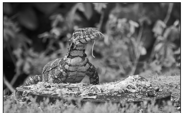
Figure 3. Adult Varanus ornatus eating food remains at a tourist camp in Nyonié, Estuaire Province, Gabon.

IRSNB 18388: SEEF (Société Equatoriale d’Exploitation Forestière) logging concession, transect R5 (0°25’42”N, 10°30’22”E; alt. 490 m asl), Monts de Cristal, Estuaire Prov., 26 Oct. 2011. It shows a frontal longer than wide; anterior pair of sublinguals longer than posterior pair; the color of the ventral