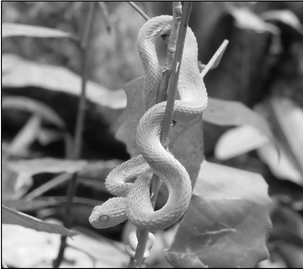
Figure 9. Live orange Atheris squamigera in Mondah Forest, Estuaire Province, Gabon.

P.M. in the sand on the beach under a soaked piece of driftwood, at 9 m from the wave line. SVL 99, TaL 2.5 mm. Dorsum dark grayish-brown, belly lighter. Tail tip and lateral and lower parts of head whitish. DSR 20 at midbody. When caught, it defended itself using the terminal spiny scale of its tail. First record for Quartier Tahiti; within Libreville, this snake is thus currently recorded from quartiers La Sablière, Louis, Quaben and Tahiti (Pauwels et al., 2004).