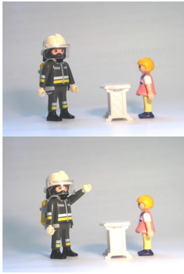
(A) Attribute present