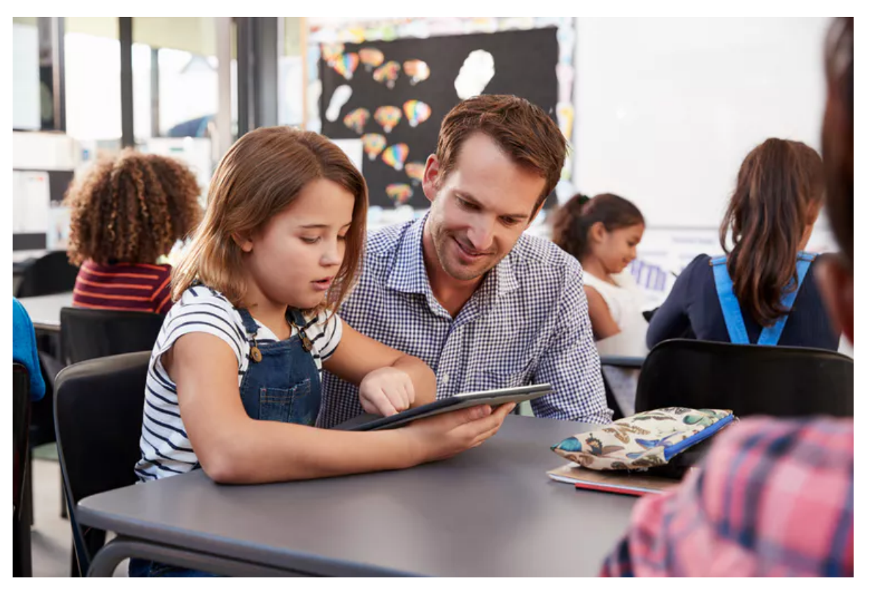
There are concerns that concentrating on personality testing could distract teachers from actually teaching.

The assumption behind the test is that social and emotional skills are important predictors of educational progress and future workplace performance. Large-scale personality data is therefore presumed by the OECD to be predictive of a country's potential social and economic progress.