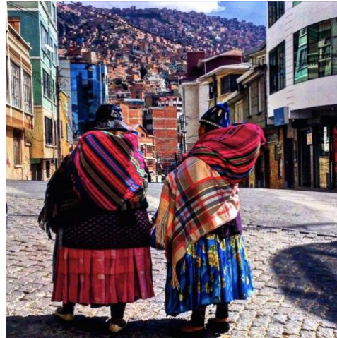
Photo 5 Women in traditional clothing, La Paz.

In La Paz, there is an array of fashion and it is not uncommon to see women wearing full 'cholita' fashion, consisting of the statement layered skirt, often brightly coloured, intricate macramé shawls and a bowler hat, perched atop long double braids, bound at the end with tassels. The spectrum of women's fashion could be travelled within the space of a 40-minute teleferico ride. It is worth noting that such transitions were only really visible in relation to women; there were no stark differences between men. What it signified clearly was that those wearing cholita outfits were indigenous. As for other people, indigeneity was not so obvious, including four of the women in Las Brisas who identified as indigenous but did not wear clothing that revealed this identity.