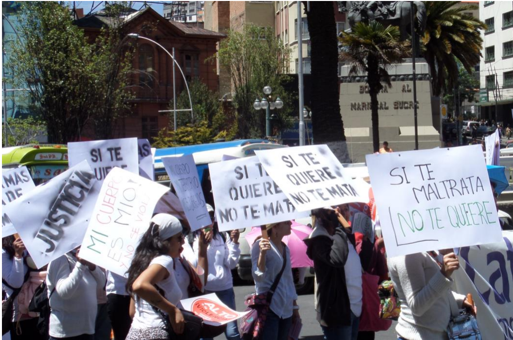
Photo 4: United Nations International Day for the Elimination of Violence Against Women, La Paz, 25 November 2014. Translations: ‘My body is mine’; ‘If he loves you, he won’t kill you’; ‘If he mistreats you, he doesn’t love you’.