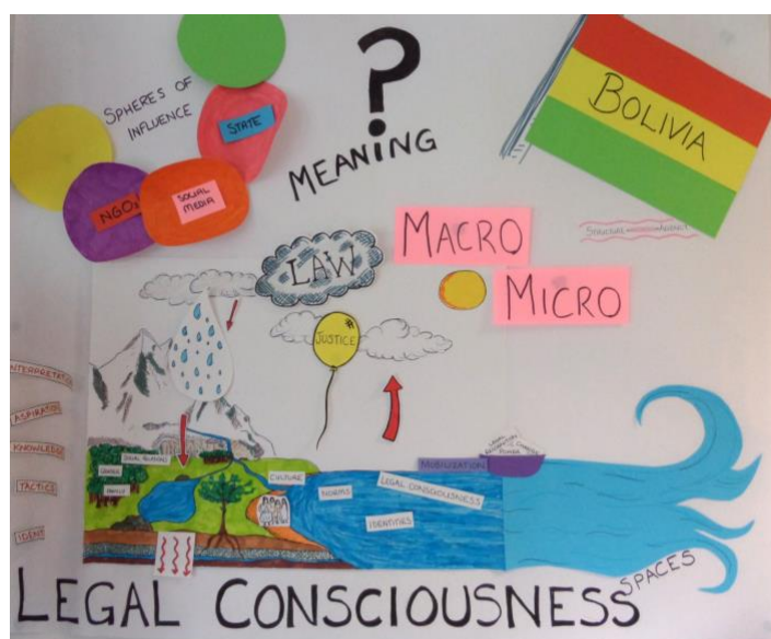
Figure 2: Early efforts to make sense of data ('Drawing to see')

Theoretical frameworks that had informed this research - along with a field-informed approach - meant that deductive and inductive reasoning influenced the process of data analysis. Thematic analysis was decided to be the most appropriate technique for analysing the data in order to avoid using yet another framework (see Braun and Clark 2006). Ewick and Silbey's (1998) cultural schemas of legal consciousness were drawn on throughout the analysis, as was Halliday and Morgan's (2013) conceptualisations of legal consciousness. This offered a more accessible approach (Braun and Clark 2006). Although there were aspects of the analysis guided by the theoretical framework, in relation to spaces inside and outside of formal legal spaces, constructions of subjectivity, and cultural schemas of legal consciousness, thematic analysis allowed a rich thematic description of the entire data set to be presented. As Dunne et al. (2005: 83) explain, qualitative texts are often coded with reference to the researcher's conceptual framework. These stages of analysis were completed on paper only, greatly aided by the use of mind maps, coloured pens, and scissors and, at one point, an artistic visual representation of the overarching narrative that appeared to be emerging (Figure 2).