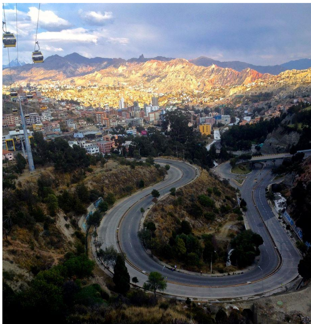
Photo 2: Mi Teleferico, yellow line, La Paz.

smog in the city and, therefore, reduce overall pollution. However, the freer movement of people has given rise to some tension between the wealthier areas of Irpavi and Zona Sur (located in the lower regions of La Paz) and the increase in indigenous peoples from the altiplano (high plain). Tensions witnessed early on, demonstrated the complicated context of Bolivia that I presented in Chapter One, and the cultural diversity of this bustling city.