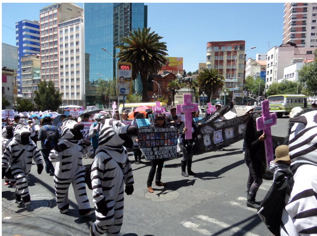
Photo 3: United Nations International Day for the Elimination of Violence Against Women, La Paz, 25 November 2014

During this event, I volunteered with the Municipality (Council) of La Paz at the end point of the march and the hub of activity, in Plaza San Francisco. Working on the stalls giving out leaflets about violence, helping to put up posters around the area, as well as organising musicians, performers and bands before they would go on stage to perform, all provided opportunities to observe and engage in conversation with many members of the public. The event was attended by thousands of people. As the sun burned my shoulders, I realised I was watching something important unfold. Women were mobilising and marching in response to injustice, oppression, violence and institutional failures. Such events throughout my fieldwork were important sites of observation and reminders of the centrality of the issue of gender-based violence in Bolivian women's lives. The women's centre chosen as a fieldsite further illustrated this.