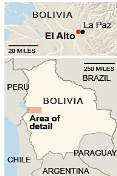
Figure 1 Map of Bolivia

populations (Goodale 2002) or provides broader political engagements that lack interaction with lived experience (see Goodale 2009, Lazar 2008 and Postero 2006, for excellent ethnographic work in this area).