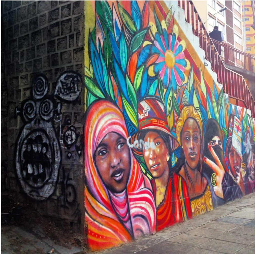
Photo 8: Street art at the side of the road, La Paz

The many marches and protests that can be seen in La Paz are, according to Luna Sanz (2017), growing in frequency and ferocity. They spread their messages in any way they now can, across the cities, in the streets, in workplaces, and on the internet, and whilst these do not always reach the rural areas in the same ways (according to the perceptions and understandings of three quarters of women in Las Brisas), there are also similar resistive strategies taking place there. These are constructed and carried out in ways that are meaningful for the local lived realities and experiences of those locations. In a complex political, social and legal context like Bolivia, such social movements have proven to drive change in the past, and so although the