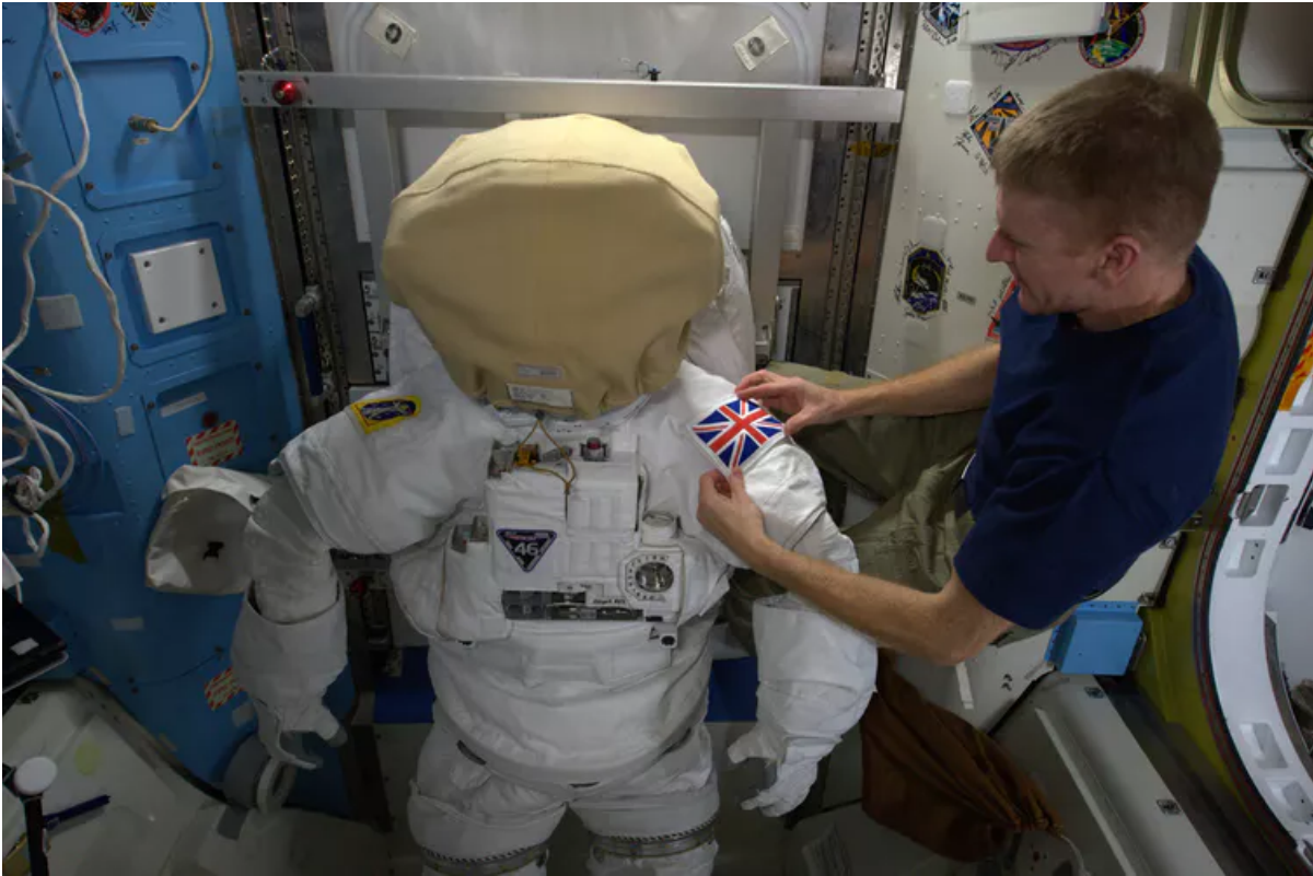
Tim Peake prepares his Extravehicular Mobility Unit spacesuit.

But what exactly will he be going through, during his remarkable spell aboard the space station? Space travel leads to many changes in the human body, many of which have been investigated since Yuri Gagarin made the first manned spaceflight in 1961 – and an extensive team provides guidance and preparation for astronauts before, during and after any spaceflight. But if you're planning an out-of-this-world trip, here are some of the things to expect.