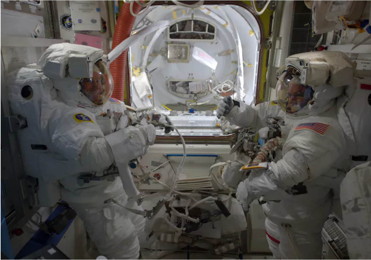
NASA astronauts Scott Kelly and Tim Kopra prepare for a spacewalk, December 2015.

however, the heart and blood vessels change – and the longer the flight, the more severe the changes.