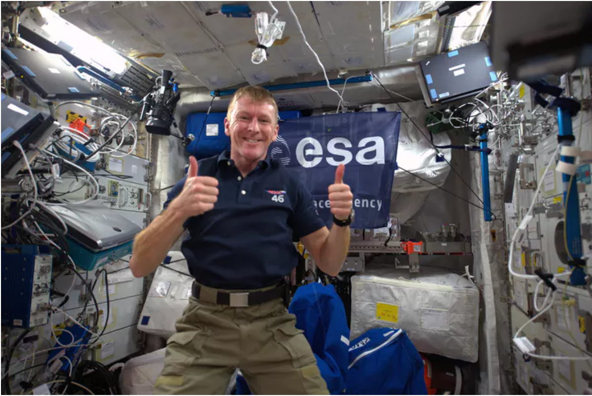
Feeling good: Tim Peake aboard the ISS.

After nine to 14 days of spaceflight, for example, research shows that aerobic capacity ( VO_{2peak} ) is reduced by 20%-25%. But the trends are interesting. During longer spells in space – say, five to six months – after the initial reduction in aerobic capacity, the body appears to compensate and the numbers begin improving – although they never return to pre-trip levels.