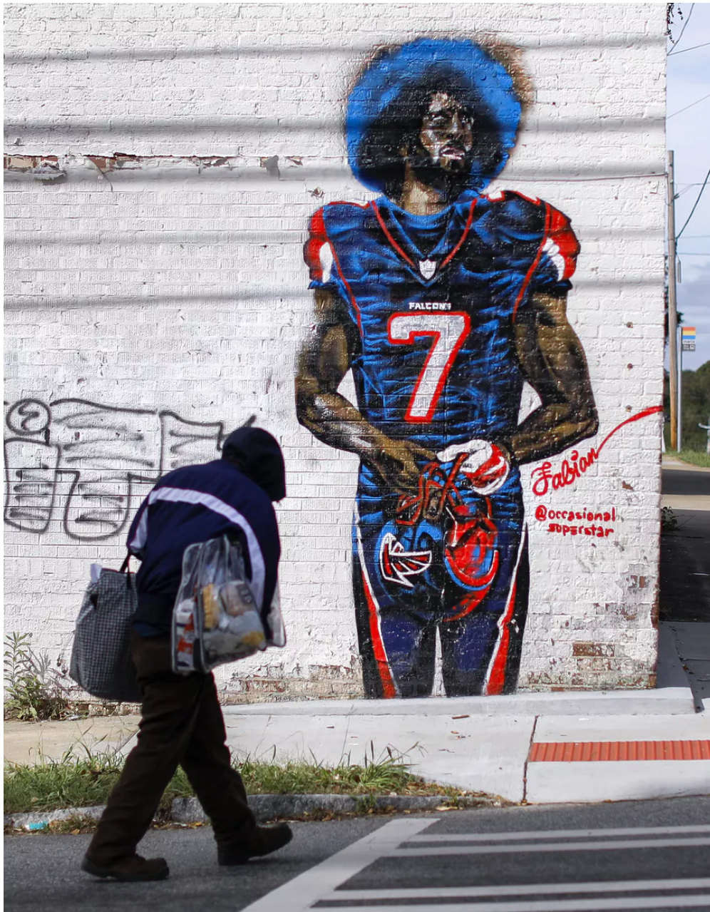
Colin Kaepernick mural in Atlanta, Georgia.

Nike reignited a culture war recently by revealing Colin Kaepernick as their spokesperson for the 30th anniversary "Just Do It" campaign. The sportswear brand's announcement came via a new advert in which young African Americans, Muslim women, physically impaired athletes and white skateboarders all encourage the viewer to follow their dreams, no matter how crazy.