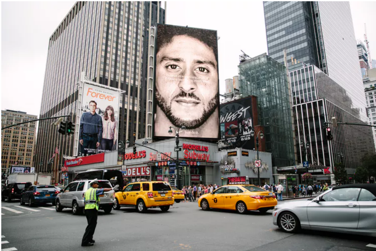
Nike's new campaign ad in Times Square, New York.

But the company suffered an own-goal this spring, when a New York Times investigation revealed complaints from 50 current and former employees about Nike's "boys' club" culture of sexual harassment and gender pay disparities. The allegations led to several high profile departures from Nike headquarters in Oregon, but it didn't end there.