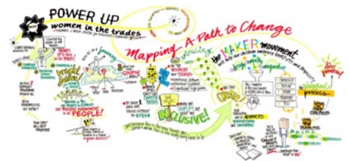
Figure 2 is an example of a graphically recorded presentation that was given as a keynote talk.