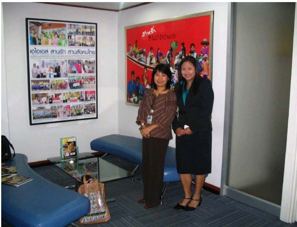
At the interviewee' office