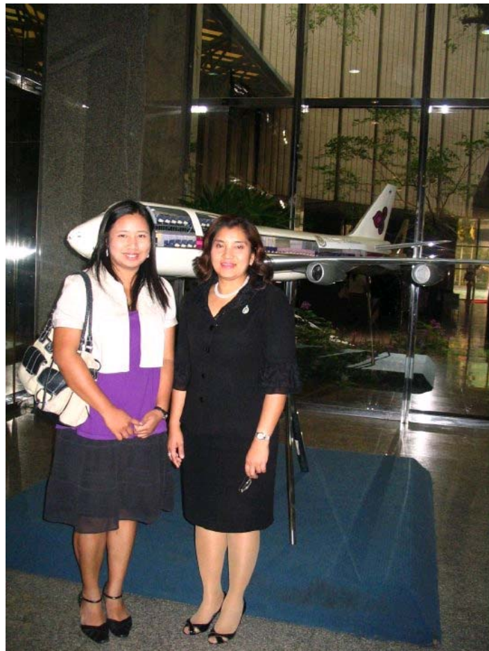
At an interviewee's office