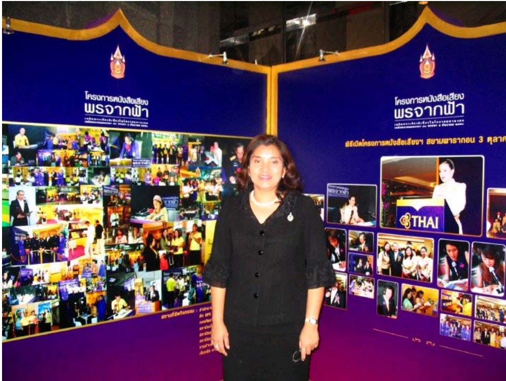
An interviewee with her exhibition