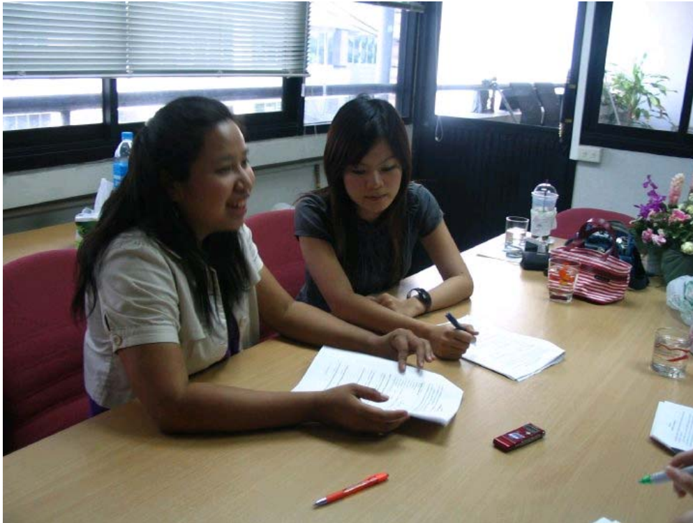
Interviewing a junior practitioners at UTCC