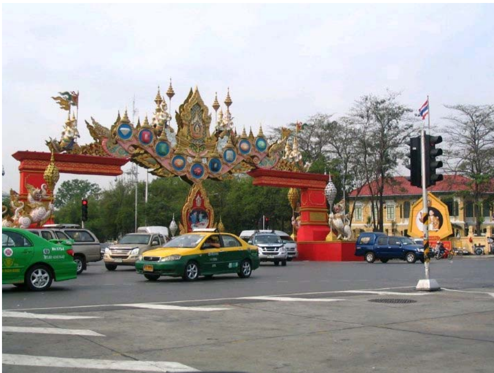
The traffic jam on the way to the interviewee's office