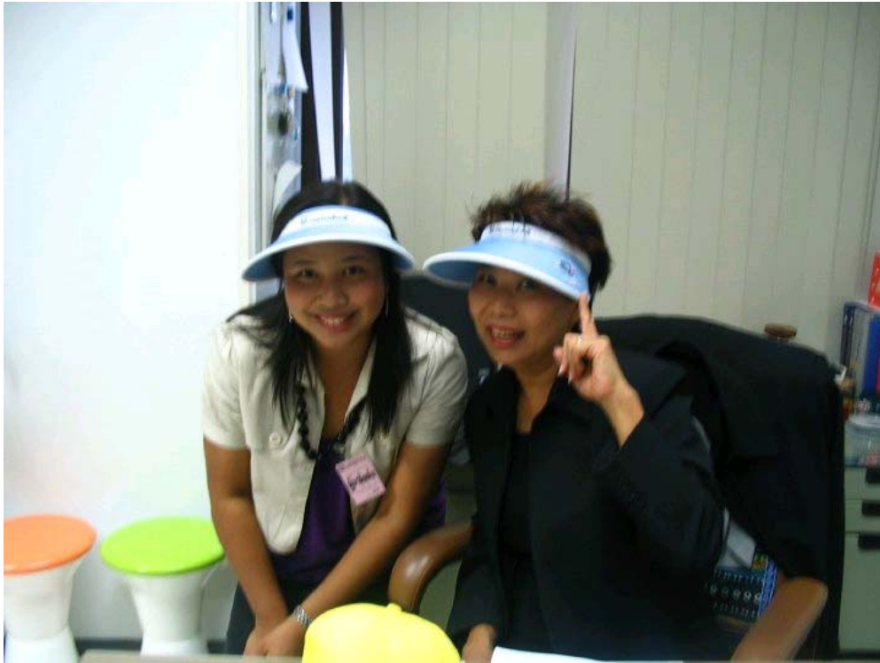
At an interviewee's office with an interviewee and her PR stuff