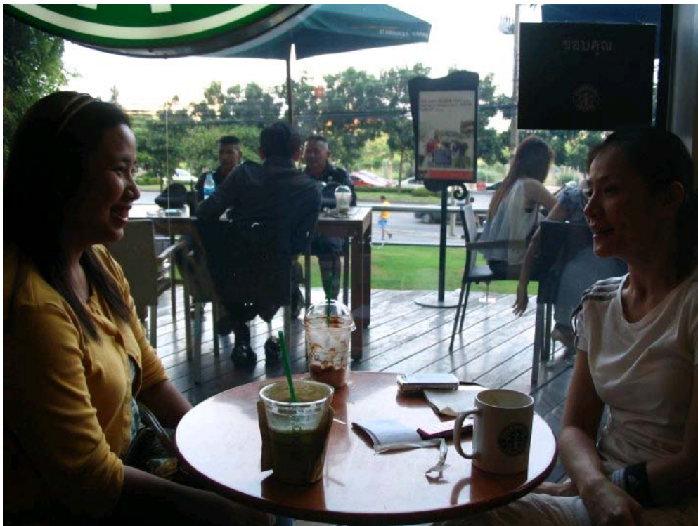
Interviewing in the coffee shop