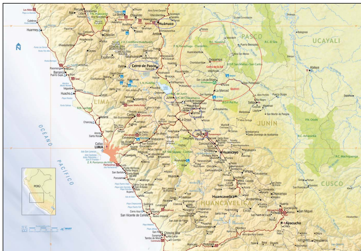
Figure 6.1: Map of Central Peru (s.a.) (with kind permission of Walter Wust, © www.walterwust.com ) (Highlighting by SDS: blue – colonial era highland entries to the lowlands; red – Amage/Yanesha’ area)