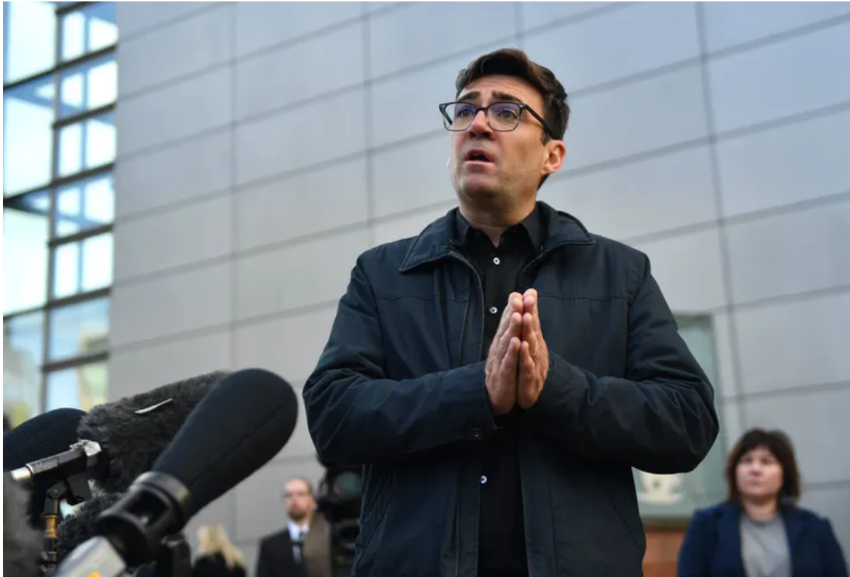
Manchester mayor Andy Burnham makes his case in public.

people on side. If they consider it insufficiently generous, they may cause harm – not merely to the Johnson government’s re-election prospects but to wider society.