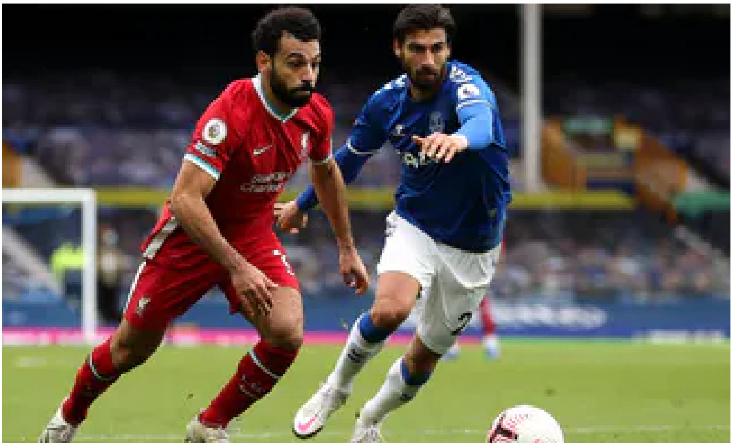
Not every football club is going under – here's how some are improving financial results