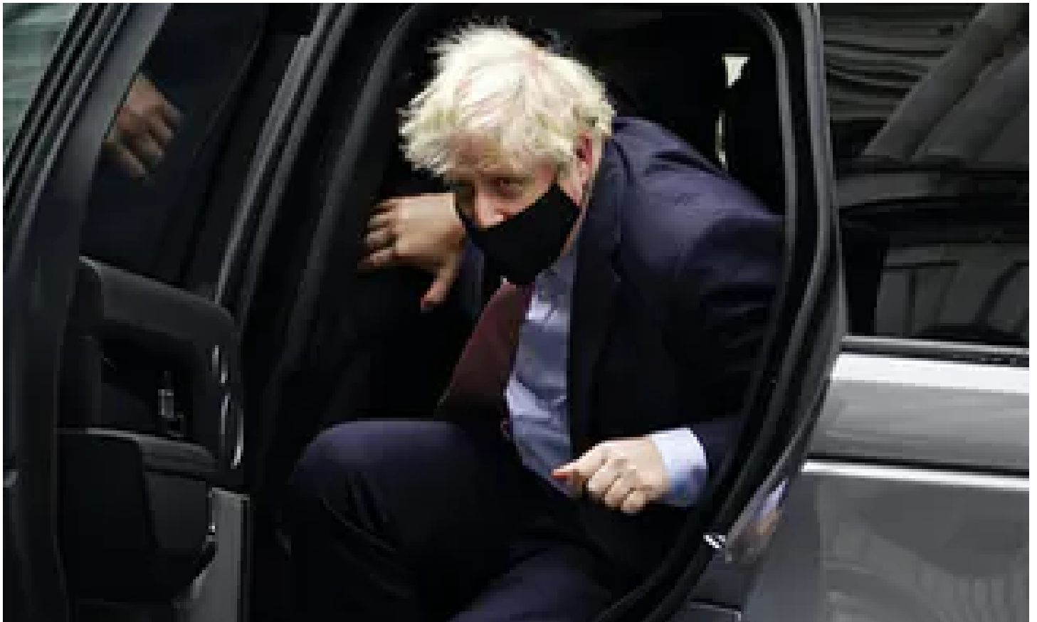
Coronavirus confusion: the prime minister cannot keep riding two horses at once