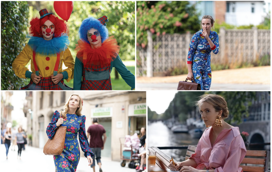
Figures 1–4: Villanelle's chameleon-like wardrobe in Killing Eve , Seasons 1–3, 2018–20, UK.