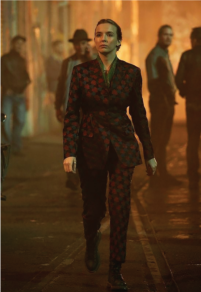
Figure 11: Villanelle confidently struts through the Berlin club scene, Killing Eve, Seasons 1–3, 2018–20, UK. © BBC America.

McNaught (Susannah York). In rejecting modes of femininity constructed by the heteropatriarchy, the adoption of masculine dress signifies a rejection of male domination and authority, functioning as a ‘demand for the right to power and authority’ (Wilson 2013: 173; Blackman and Perry 1990). Whilst trouser-wearing women are largely no longer taboo in public situations (Wilson 2013), Villanelle’s suited swagger as she walks through the European city streets speaks of a queer performance of tough, self-assured confidence that is also ‘erotically enticing’ (see Kennedy and Davis 1993: 159; Geczy and Karaminas 2013).