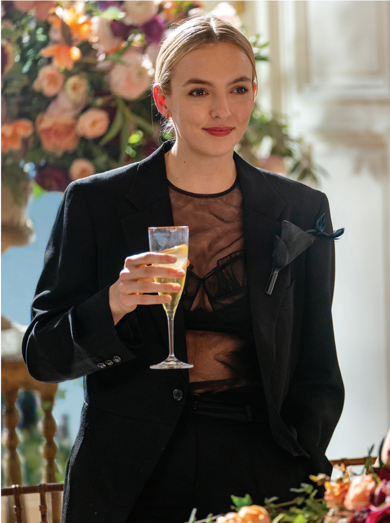
Figure 10: Villanelle's wedding suit, Killing Eve , Seasons 1–3, 2018–20, UK.

1975 photographs for French Vogue . Inspired by the 'mannish costumes' of iconic stars such as Dietrich and Garbo, Saint Laurent's reworking of the tux constructs a strong and determined image (Geczy and Karaminas 2013: 35; Gundle 2008; Bruzzi 1997), but it is one that is imbued with an intense eroticism. Villanelle's Commes des Garçon jacket is cut longer – whilst repeatedly referred to in the journalistic discourses as a tuxedo, it is a morning coat. Worn as men's lounge suits for leisure, the morning coat with its elongated tails is now more commonly reserved for formal occasions such as weddings. The flowing jacket skims the body and contrasts mannish tailoring with soft, translucent fabrics that draw attention to the body beneath, through the bustier blouse. To Saint Laurent, 'a woman was no less feminine in a pair