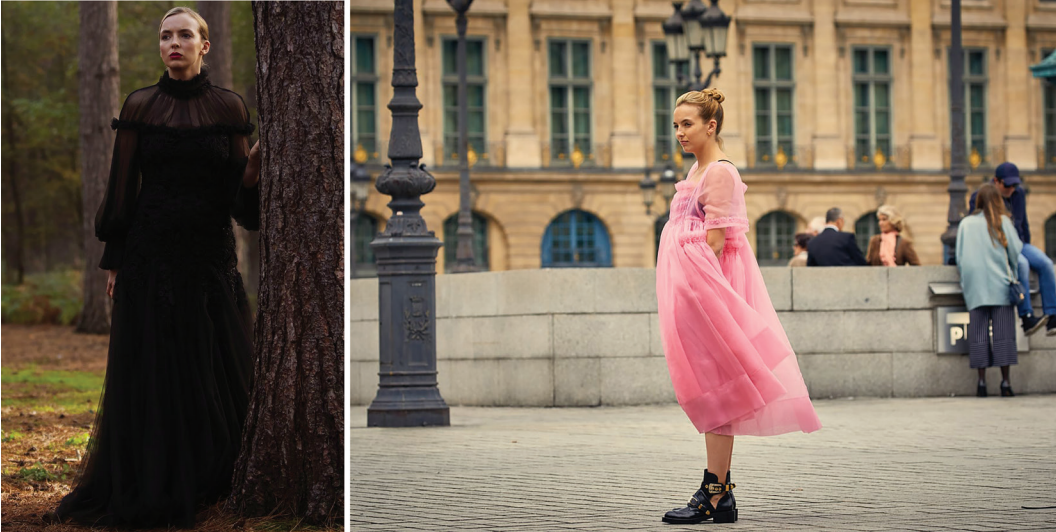
Figures 5 and 6: Villanelle dressed in Alexander McQueen (left) and Molly Goddard (right), Killing Eve , Seasons 1–3, 2018–20, UK.

Tall, lean and youthful, Comer functions as performer-model-celebrity as she effortlessly moves from TV drama to fashion editorial, in accordance with the trends and tensions within contemporary visual culture (see Church Gibson 2012). Despite the spectacle of costuming, there is a conspicuous absence of a verbalized fashion discourse within the series; instead, such ‘written clothing’ appears together with ‘image-clothing’ (to borrow from Barthes 1967/1990), in the copy of cross-media promotional editorials and user-generated content on blogs and social media platforms. Although many of the garments Villanelle wears are sourced designer fashion items from established and emerging brands, when they appear on-screen it is important to remember they are in fact costumes (also see Wolthuis forthcoming 2021: 10). The work of Killing Eve ’s costume designers Phoebe De Gaye, Charlotte Mitchell, and Sam Perry (for Seasons 1, 2 and 3, respectively) creates a visual narrative that supports characterization and the technical and physical demands of performance and production (see Stutesman 2011). Seemingly mismatched garments that should not go together create a tension that is intrusive and theatrical and also at times is humorous and tongue-in-cheek. There is not a stable image that ‘is’ Villanelle, rather, she exists as surface appearances, highlighting her fluidity on and beyond the screen.