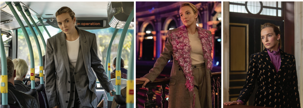
Figures 7–9: Villanelle's suited style in Killing Eve , Seasons 1–3, 2018–20, UK.

The eroticism of androgyny that permeates the representation of Dietrich, or Greta Garbo in Queen Christina (Mamoulian 1933) is characterized by a combination of glamour, clean lines and tailoring (Gundle 2008; Bruzzi 1997; Gaines 1989; Landy and Villarejo 1995). Through clothing and performance, Dietrich constructed herself as the 'point of multiple erotic identification' (Bruzzi 1997: 175), and this is exemplified by Villanelle's wedding outfit at the start of Season Three (see Figure 10). Her look is reminiscent of Yves Saint Laurent's (YSL) 1966 Le Smoking and in particular Helmut Newton's iconic