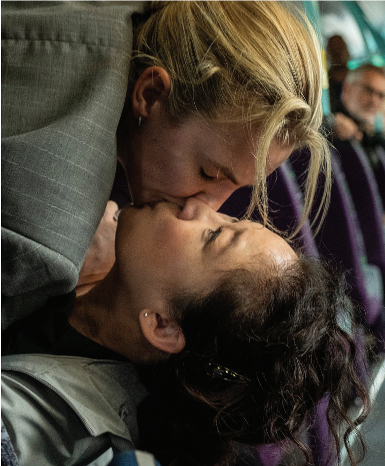
Figure 18: Villanelle bears down on Eve, Killing Eve , Seasons 1–3, 2018–20, UK.

Matter of Images , there is a ‘discrepancy between symbols and what penises are actually like’ (2002: 90). The visual symbolism of potent phallic power is not the same as the fragile, delicate penis that can get caught in a trouser zip. The suit, as Anne Hollander discusses, enables the material body to be recut into an idealized image, where the nude is ‘even more natural when dressed’ (1994: 90). Villanelle appropriates menswear as a new skin to recast herself as seemingly ever more powerful, phallic and sexually assertive. Through its volume, it creates a void between the materiality of the flesh and the structural and sculptural fabric form. Such sartorial spaces reconfigure, reconstruct and expand the frame of the body to create a hard, powerful suit of armour that acts as sartorial architecture (see Bruno 2014; Quinn 2003).