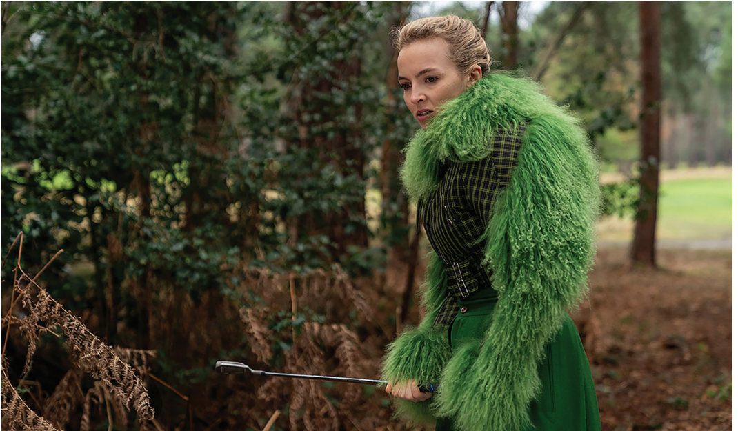
Figure 26: Villanelle in a Charlotte Knowles jacket, Killing Eve , Seasons 1–3, 2018–20, UK.

its very intangible and shifting existence as sign, theory and field of reference (2019: 15). Villanelle's visible disgust for instance, as she places her bare feet into the embellished (pseudo) crocs in the hospital, calls into question the playful trolling of fashionistas by Christopher Kane (SS2017) and Demna Gvasalia for Balenciaga (SS18). Villanelle may love luxury fashion, but a bejewelled croc (Minton 2018; Logan 2017; Wynne 2016) is perhaps a camp step too far.