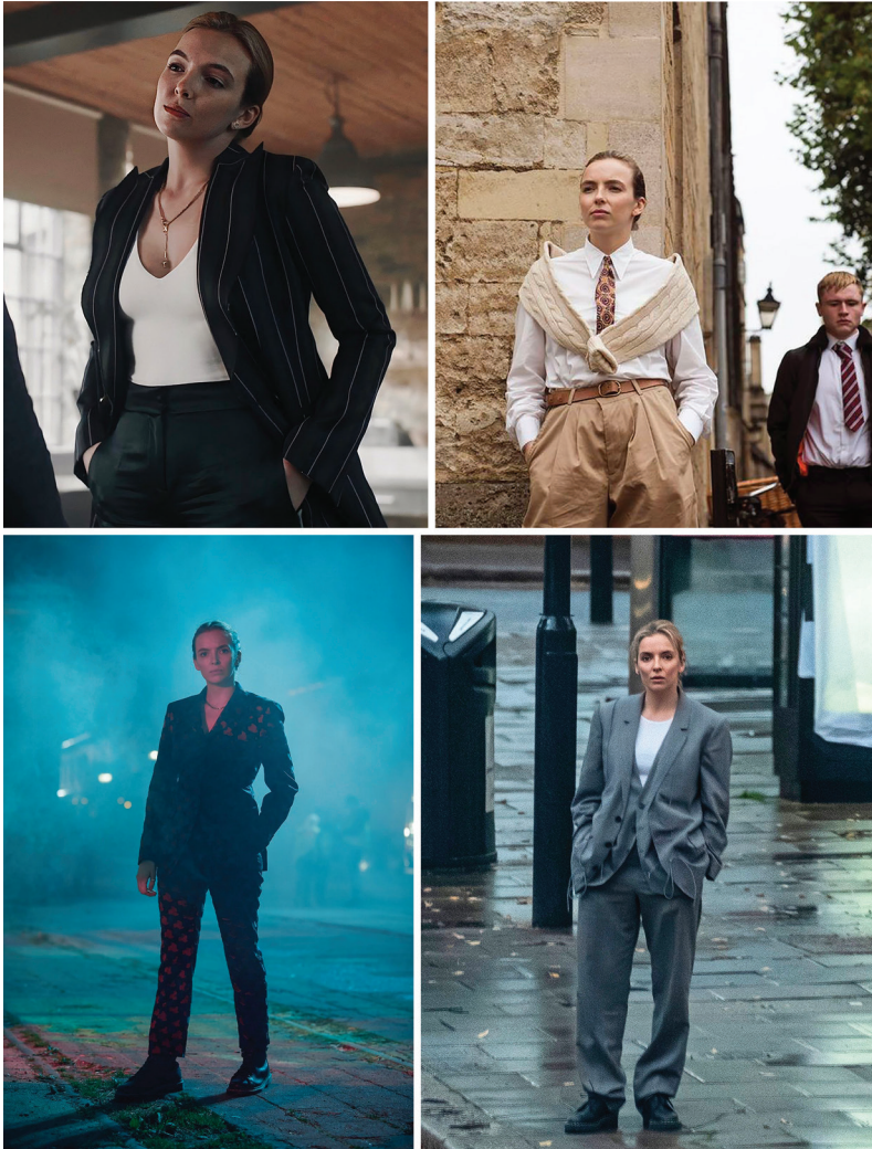
Figures 14–17: Villanelle’s bold trouser pocket stance, Killing Eve , Seasons 1–3, 2018–20, UK. © BBC America.

power are displaced onto the hands. Like the ‘sexually voracious and excessive’ lionne , who ‘dipped into the pool of male activity’ (Geczy and Karaminas 2013: 26), Villanelle’s assertiveness is also attractive.