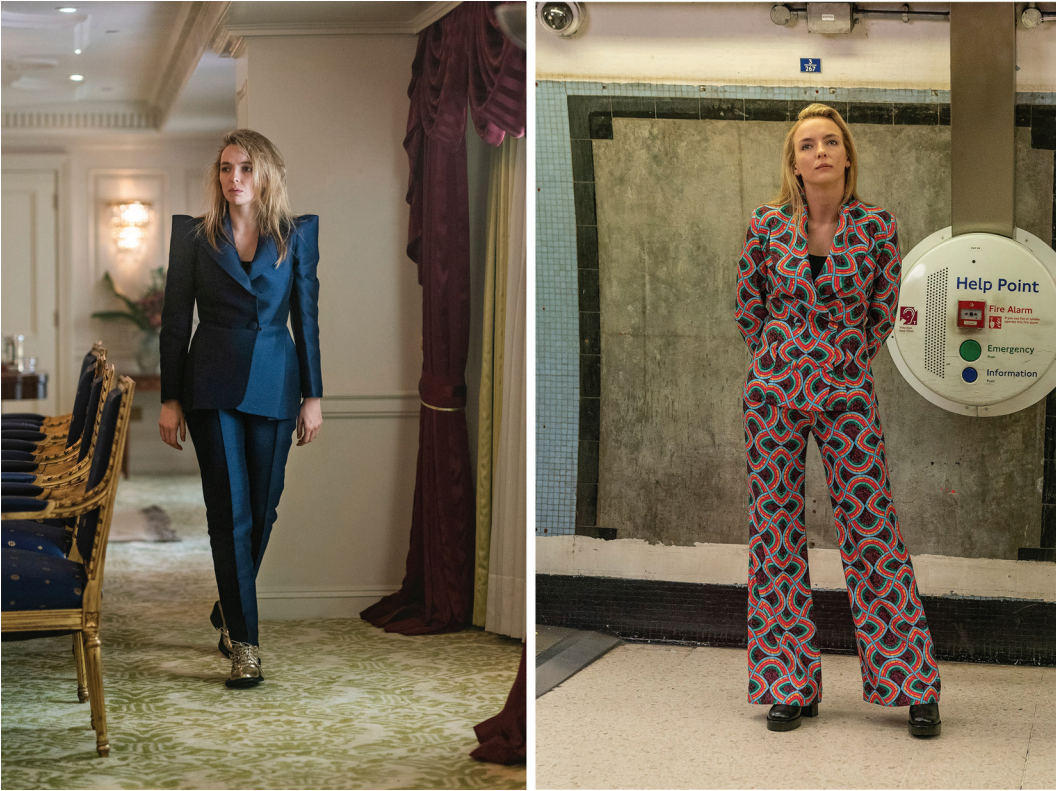
Figures 12 and 13: Queering suiting in Killing Eve, Seasons 1–3, 2018–20, UK. © BBC America.