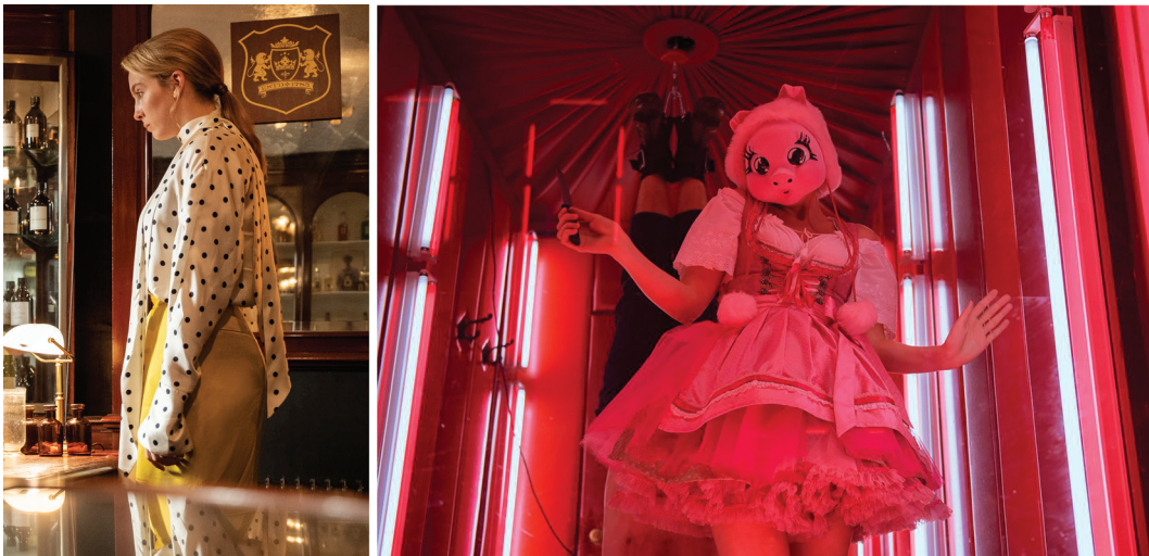
Figures 24–25: Artifice, playfulness and camp in Killing Eve, Seasons 1–3, 2018–20, UK.

From the drama of the black Alexander McQueen dress, to the pink tutu worn with the dirndl and pig mask, Villanelle’s outfits are outlandish, opulent and at times extraordinary. She embodies the notion of ‘being-as-playing-a-role’: for her, every mission is an opportunity to treat life as theatre through impersonation (see Sontag 1964: 9–10). Carnival, transgression, the unstable and the bizarre become integral to Villanelle’s queer style, as each look reveals a plurality of appearances which resist conformity to heterosexual normativity (see Geczy and Karaminas 2013: 4–5). When coupled with Comer’s playful and tongue-in-cheek performance Villanelle is constructed as a camp killer. Camp through its winking, yet discerning, eye, lends itself, as Fabio Cleto argues, not only to lists of its qualities, characteristics and instances, but also highlights