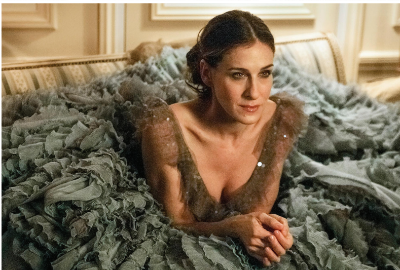
Figures 22–23: Villanelle at her therapy session (top), Killing Eve , Seasons 1–3, 2018–20, UK. © BBC America. Carrie awaiting Petrovsky in Sex in the City (bottom), Seasons 1–6, 1998–2004, USA. HBO.