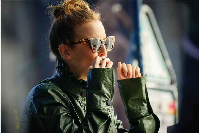
Figures 19–21: Villanelle's costuming is characterised by artifice and exaggeration, Killing Eve , Seasons 1–3, 2018–20, UK.

queer aesthetic embraces and amplifies the stereotypical femme to embrace camp. Standing in the Place Vendôme in Paris, adorned in billowing pink tulle Molly Goddard dress and cutaway black Balenciaga boots, Villanelle offers 'statement-making style' (Yotka 2018: n.pag.). The look, as costume designer Phoebe de Gaye argues, offers a 'subversive streak' in which Villanelle both dresses and acts like a 'mad little girl' through colour and the 'mixture of the extremely feminine, almost to the slightly perverse point, with those boots, which are a good mix' (de Gaye in Yotka 2018: n.pag.). Engulfed by the swathes of tulle against the Parisian landscape, the dress initially appears to offer an excess of glamour. In contrast to Grace Kelly's tulle-laden perfection in Rear Window where, as Bruzzi argues, Lisa 'is perfect to a fault, she is too beautiful' (1997: 18), the calf-length cut, ruching and puffed sleeves swamp rather than skim Villanelle's body. When seated at her therapy session, Villanelle's dress echoes the iconic shots of Carrie in Sex and the City (1998–2004), adorned in her grey Atelier Versace gown (Season 6).