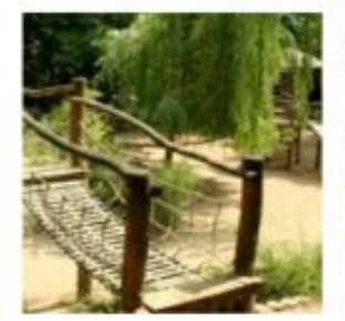
Paths, Bridges, Access. We can get closer to nature with good pathways whilst still leaving some places just for nature too.

What kind of paths might be useful for getting close to nature on a reserve? What makes a path inviting to use? What new kinds of paths or access would you like to see on a redeveloped reserve?