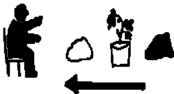
Figure 1. Schematic diagram representing the object-moving system of spatial perspective.

In the present study, we investigated how ambiguous spatial terms are understood, focusing specifically on the role of experience. Some researchers have suggested that language—in particular, abstract or ambiguous words—is grounded in daily embodied experiences (Lakoff & Johnson, 1999). This is consistent with research on embodied cognition, an area that highlights the influential role the environment plays in the development of cognitive structures (e.g., Barsalou, 1999; Glenberg, 1997). Although there are various extensions of this view, a common theme is that the sensorimotor capacities of an individual who is