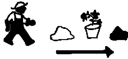
Figure 2. Schematic diagram representing the ego-moving system of spatial perspective.

interacting with the environment play a key role in directing specific cognitive facilities.