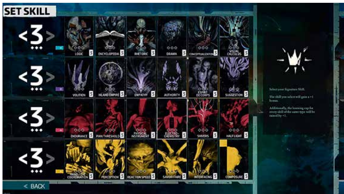
FIGURE 1. The Character Sheet of Disco Elysium