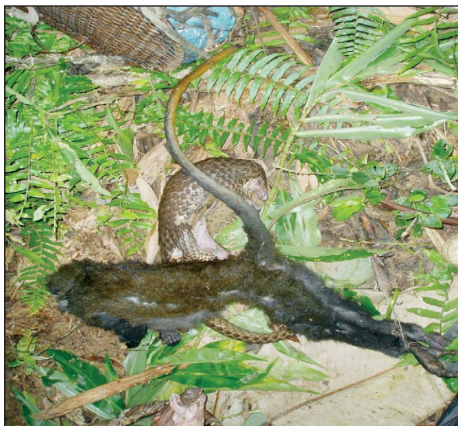
Figure 2. Adult female Cercopithecus solatus trapped near Mbégho on 7 June 2004. It shows the typical body coloration of the species: black legs, brown-reddish back and flanks, tail distal part yellowish. It is shown here along with a common pangolin Manis tricuspis that was caught in the same locality by the same hunter.

Bushmeat inquiries were led by Jean-Jacques Tanga in several villages along the roads from Baposso to Mbigou (01°53'47"S, 11°54'37"E, altitude 700 m; Boumi-Louétsi Department, Ngounié Province), Mbigou to Koulamoutou (Lolo-Bouenguidi Department, Ogooué-Lolo Province), and from Koulamoutou to Pana (Lombo-Bouenguidi Department, Ogooué-Lolo Province), i.e., the three roads respectively situated near the eastern, northern and western limits of Mount Birougou National Park (February–March 2004, July 2004, June 2005). Main localities and park delimitations are shown