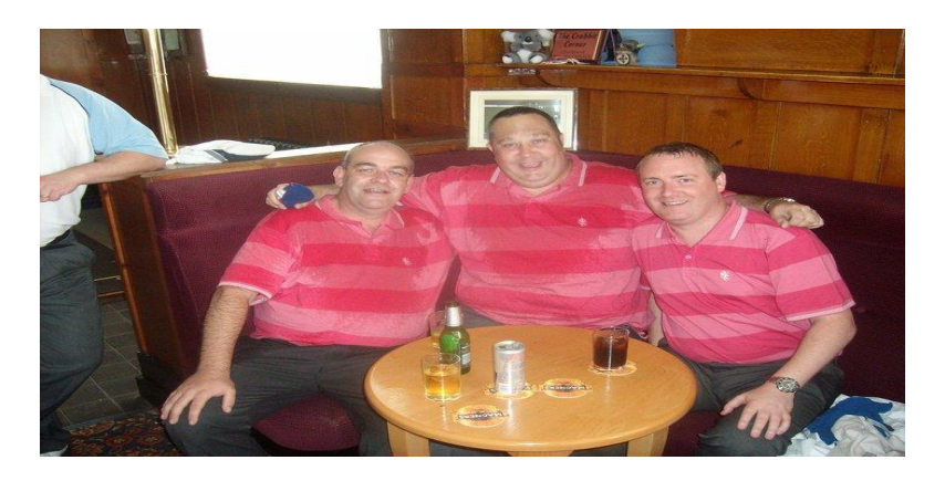
Photograph Six: The Goth and some 'named athletes'.