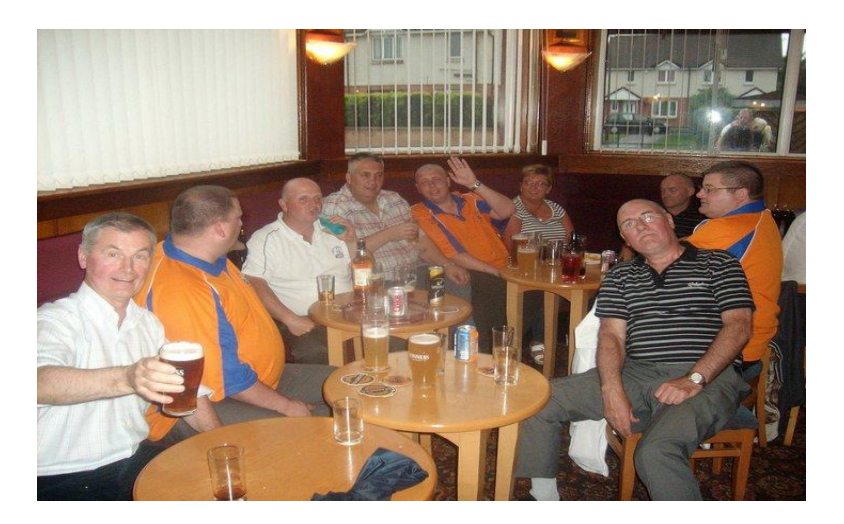
Photograph Five: Bowlers in the 'Crabbit Corner'.