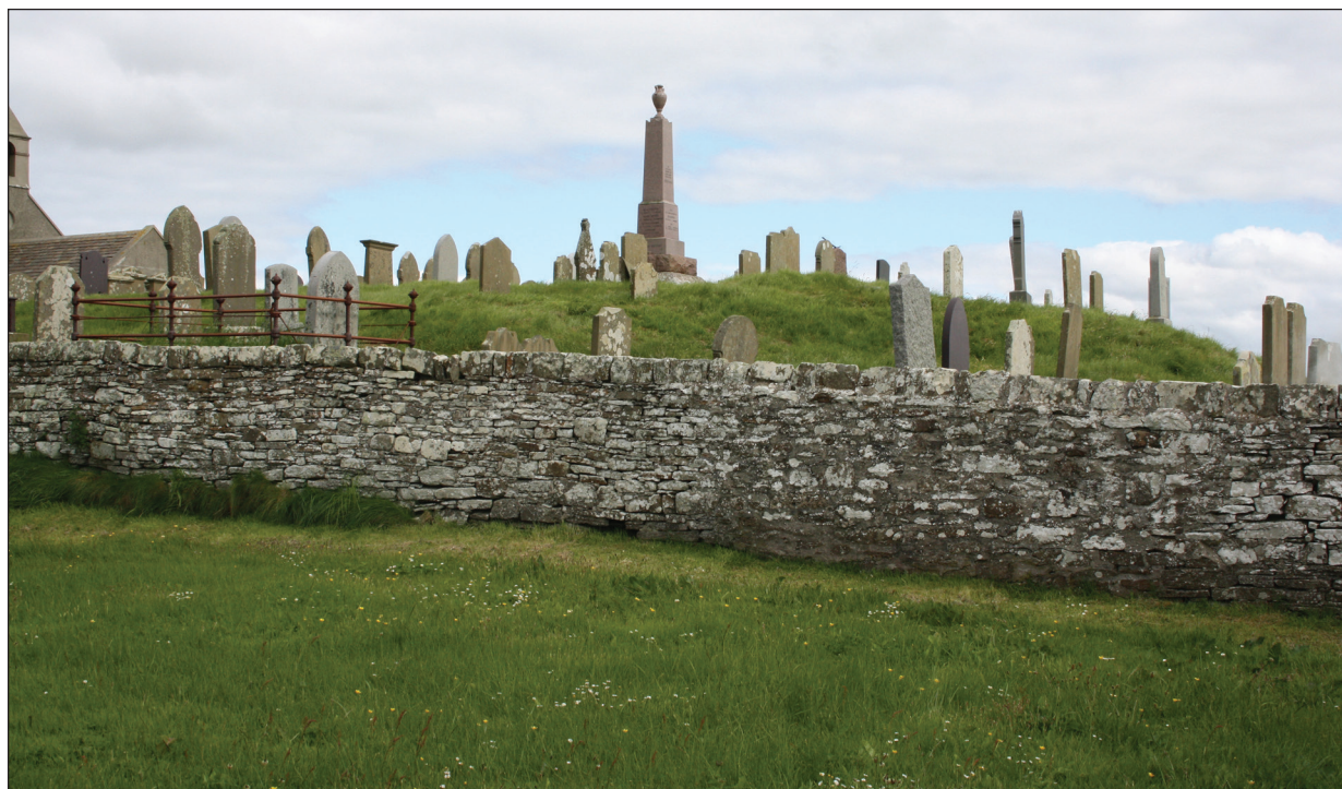
Figure 4. The mound in the churchyard at Harray, Mainland.

It is pertinent to briefly review the corpus to ascertain if any of the burials may not have been knowingly associated with an earlier monument. The burials at the Broch of Gurness and Howe (if the burial itself is accepted) were inserted into earlier monuments so their association is certain, as are the two burial clusters around two mounds in the cemetery at Pierowall Links. The exact location