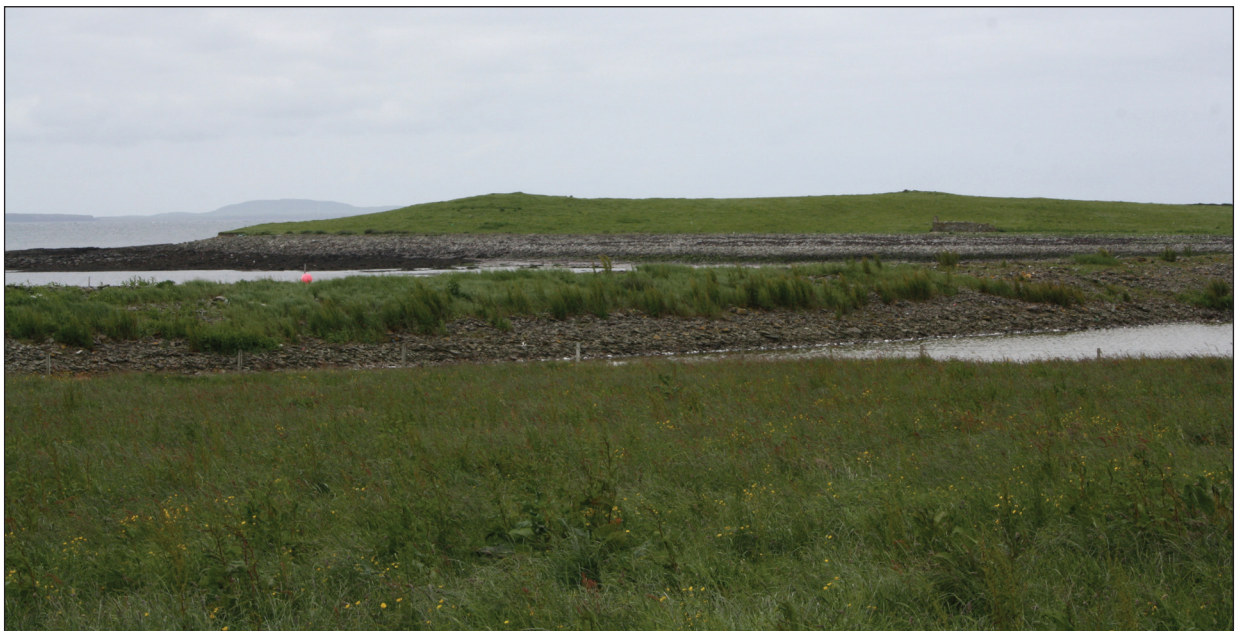
Figure 5. Mounds at the Styes of Brough, Sanday. The broch mound is on the left.

A number of the burials in the corpus are close to earlier monuments. In particular, the likely site of the Styes of Brough burial is one of four visible mounds in close proximity to each other and which are inter-visible (Time Team 1998). The broch mound in particular is clearly visible from a distance today and was probably more obvious ca. 1000 years ago (Fig. 5). The Knowe of Buckquoy mound is clearly visible less than 100 m from the site of the Buckquoy burials, but unfortunately the dating of the mound is uncertain (Fig. 1). However, there were also various other pre-Viking Age monuments in the vicinity that are no longer visible (Morris 1989:28–36). The Knowe is also visible from the Brough Road burial site, but it is over 200 m away and not immediately apparent. However, as discussed in greater detail below, these three burials were associated with two earlier cairns, one of which was re-used for a Viking Age burial (Morris 1989:114–115, 288–289). The Knowe of Moan cremation is in a field without other known archaeo-