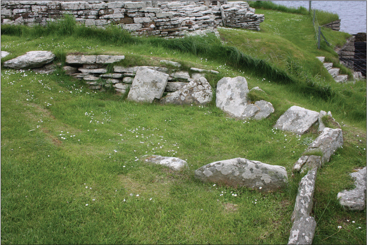
Figure 2. Reconstruction of the grave containing a Viking Age burial at the entrance to the Broch of Gurness, Mainland.