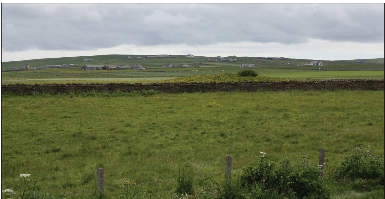
Figure 1. The Knowe of Buckquoy from the Buckquoy, Mainland, burial site.

Westness (10) – male and female adults, one infant: numerous grave-goods including two boats, weapons, oval and other brooches, gaming pieces, and combs. These burials were added to a pre-Norse cemetery in use since the 7 th century. The Knowe of Swandro broch was visible, as was, possibly, the Knowe of Rowiegar chambered cairn