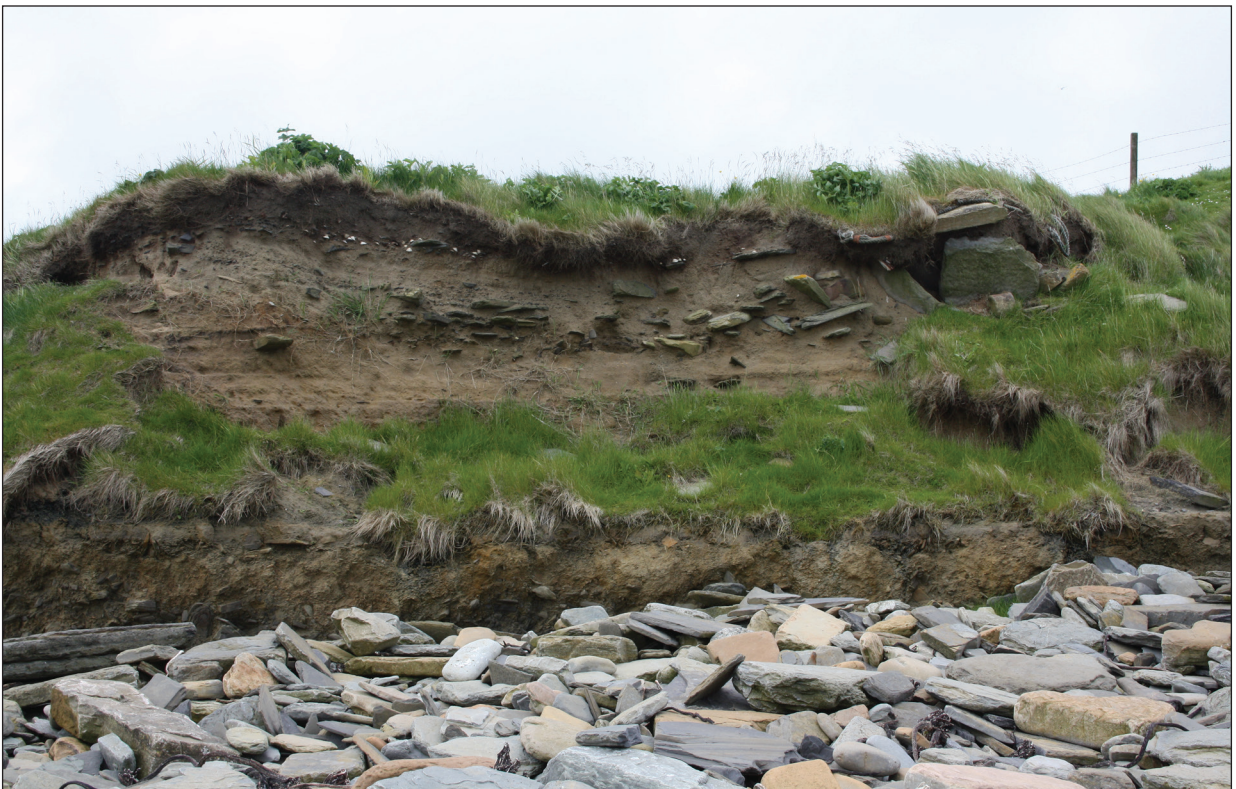
Figure 3. Remains of the settlement mound at the Bay of Skaill, Mainland, on top of which a Viking Age burial was probably found.