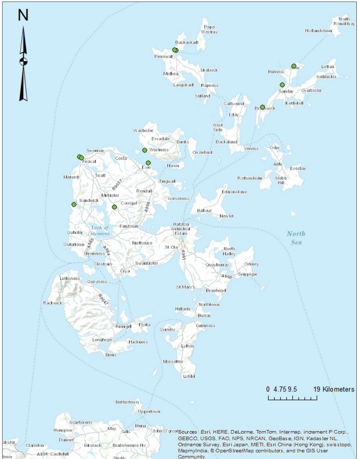
Figure 7. Map of the burial sites, excluding Howe.

reason: namely, keeping the infant close to the family (Ritchie 1977:188, Thäte 2007:120). The infant was buried in line with the door (Ritchie 1977:fig. 3)