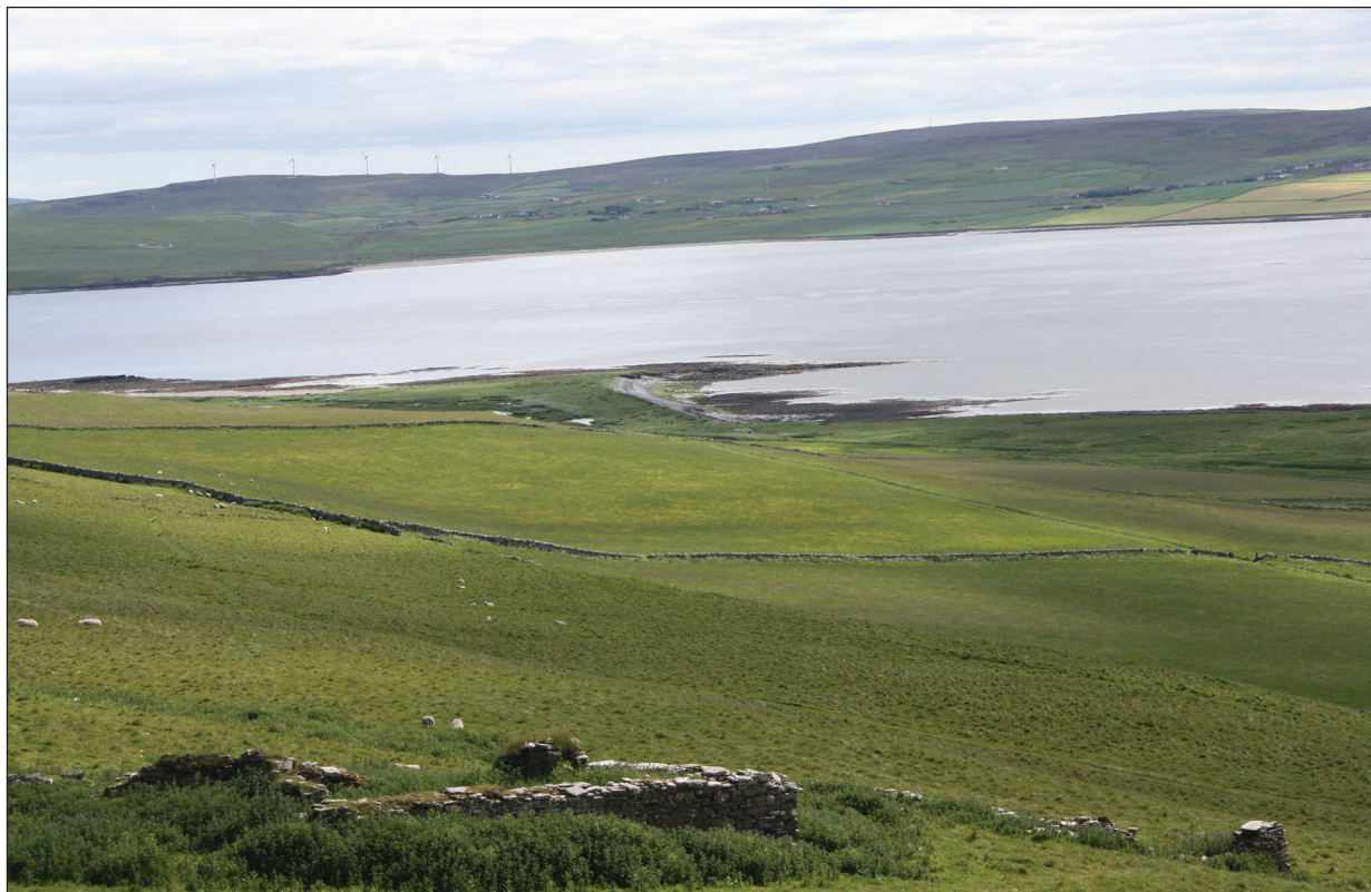
Figure 6. The beach at Westness, Rousay, directly above which lay the cemetery that included 10 Viking Age accompanied burials.

Three obvious conclusions can be drawn from examination of the above corpus of accompanied