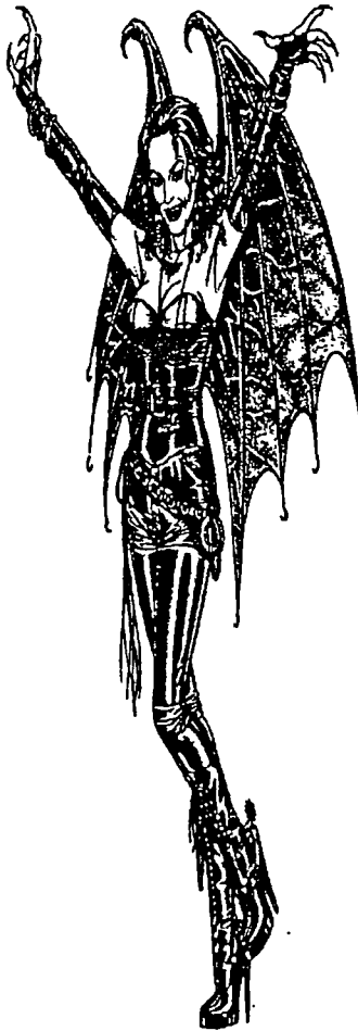
Figure 7.1 Vampire fanzine imagery (line art from The Chronicles)

In one respect, participation in Internet groups allows some respondents to make contact with other like-minded people and in particular other female fans and followers. A large proportion of the messages sent to the e-mail lists are from female subscribers: during observation of the horror e-mail list service over a three day period, fifty-six of the ninety-eight messages generated (57