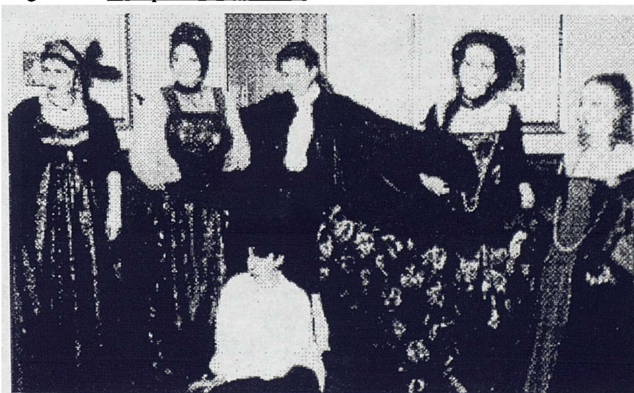
Figure 7.2 Vampire fan costumes

It would appear that, for many vampire fans, participating in fan culture allows them to dress up and act out a fantasy. The Vampyre Society is based around local groups who meet regularly in various parts of the UK. In Glasgow, many, though not all, attend in vampire costume of various forms complete with fake vampire teeth (see figure 7.2 for an example of vampire costumes). The vampire society also organises weekend vacations to country houses where masked balls and other similar activities are held. This seems to indicate a desire to appropriate historical settings and costumes, and for recreating the past and may be linked to the liking for historical costume dramas. Baert (1994) states that the property of clothing in western culture is not a stable symbol, but a circulating sign; this mobility of coding contains the potential for destroying the dominant codes of gender. The 'bad girl' look of