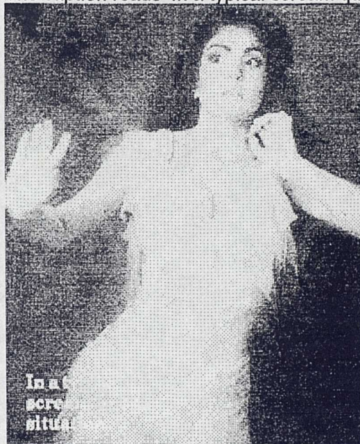
Figure A4.2: Illustration Horror Fan (Winter 1989, p. 22) The caption reads 'In a typical scream queen situation.'

Issues of Femmes Fatales feature scream queens and a few mainstream actresses who have appeared in horror or related films (e.g. Michelle Pfeiffer as Catwoman in the film Batman Returns ) and the covers - a typical example is shown in figure A4.3 - mostly depict actresses who appear to be posing for the publication itself. The similarities to soft-core pornography are obvious and the way these images are being used to sell magazines indicates how women might be regarded within one sector of the fan industry. Whilst the depiction of actresses cowering in fear and/or in a state of undress reflects one