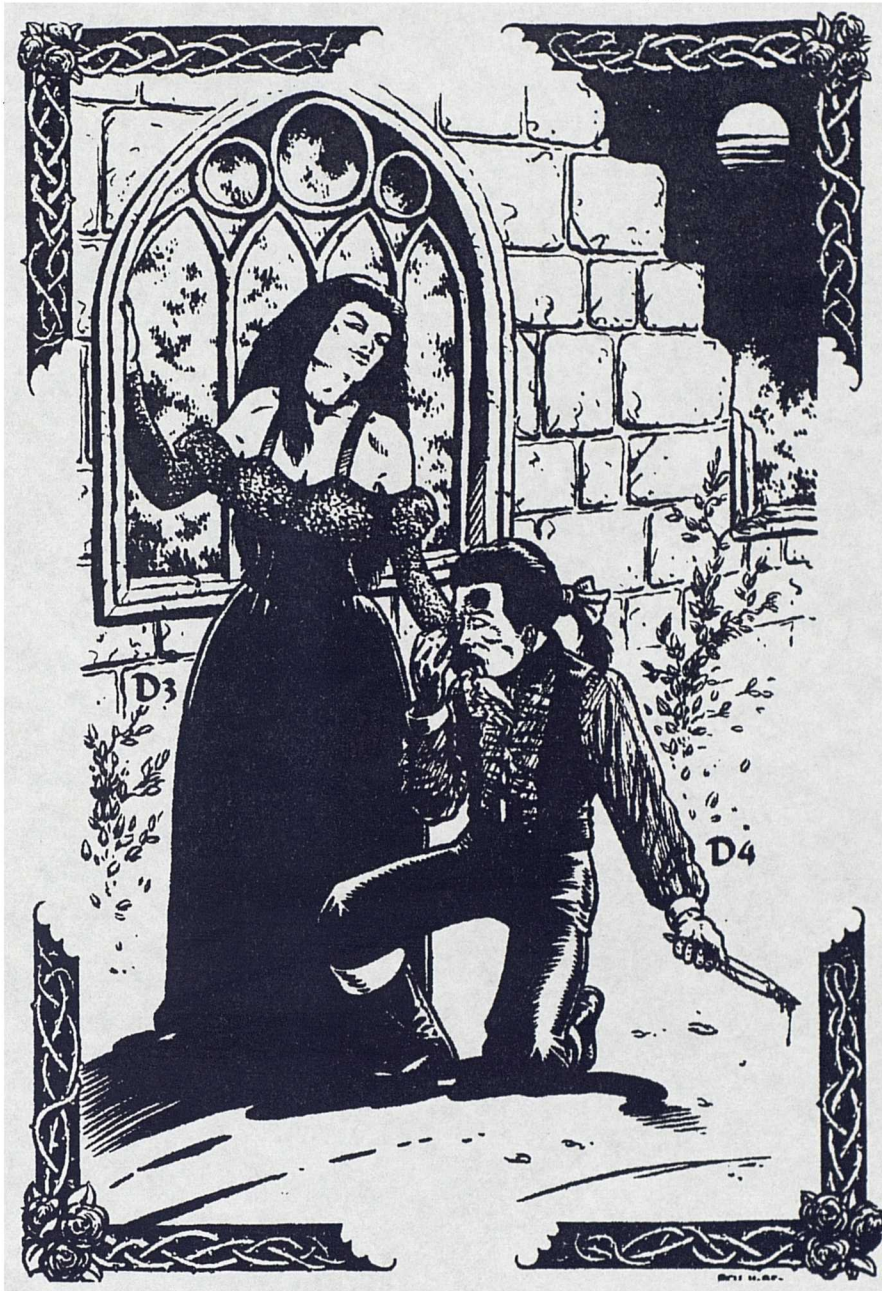
Figure 7.3 Demone mail order catalogue - sample page

becoming fixed. Mulvey (1987, pp. 16-7) states that, depending upon context, collective consciousness (unified by a ritual event such as Carnival) can either act as a spearhead for organised politics or provide a safety valve for discontent: 'In contemporary society, similar patterns may be perceived in the "rituals of resistance" associated with subcultures. A group can mark out its claim to liminal existence through clothes, music, emblematic loyalty etc.' Adoption of the vampire masquerade may, then, provide the female horror fan with a 'liminal moment outside the time and space of the dominant order' (Mulvey, p. 16) and may even allow entry into the language of politics for, as