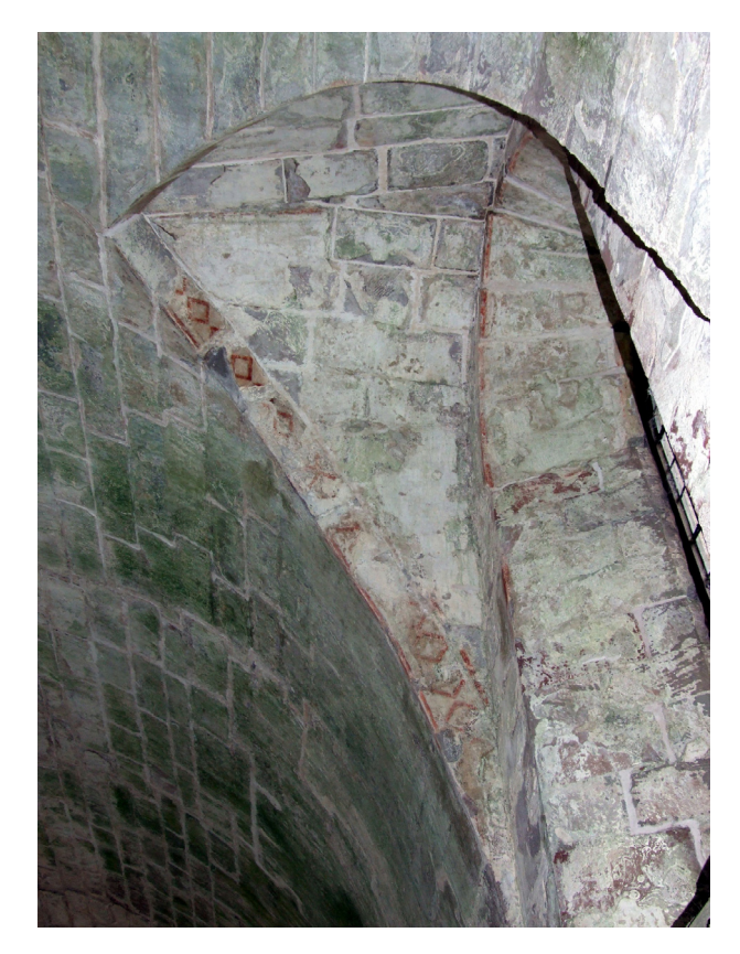
Fig. 2. Part of the mediaeval painted ceiling in the Chapter House at Dryburgh Abbey, Scottish Borders, showing details around the east-facing window. The surviving decoration is very faint. The image also clearly illustrates the greening of the stonework caused by the biological colinisation, that is the subject of periodic cleaning. The debate about the control of this surface alteration, through direct environmental control measures or cleaning, is a key conservation issue at the site (Photograph: Maureen Young, Historic Environment Scotland).

because it contains the largest area of mediaeval polychromatic wall decoration in Scotland, painted with tempera onto lime plaster (Fig. 2). However, it has been at risk for some time from water ingress from above and high air humidity. Interventions