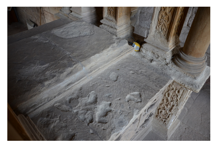
Fig. 5. Decay on the top of the tomb at the Skelmorlie Aisle, Largs. Here the dense fine-grained sandstone is suffering from cratering and powdering. At the centre top right of the image, an environmental logging device can be seen attached to the structure, recording conditions of Temperature and Relative Humidity near to where the damage is occurring.