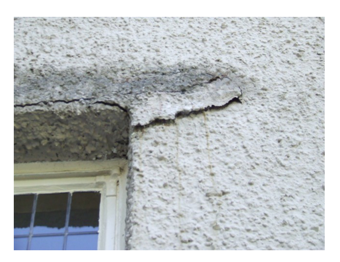
Fig. 7. Example of the cracking in the Portland Cement render of the Hill House, Helensburgh. Cracking such as this allows water ingress that threatens the historic Macintosh-Macdonald designed interior decoration and furniture.

Mackintosh to use it in his pursuit of novel, modern design values, allowing him to dispense with traditional water-shedding features, such as wall copes at gables and window cills. However, the inflexibility of the PC-based render, compared with a lime-based alternative, has resulted in extensive cracking (Fig. 7). PC's low water permeability and high capillary retention traps any water ingress that occurs through the cracks causing further deterioration of the render, exacerbated by freeze-thaw action. In places, moisture has penetrated the whole wall, putting the Mackintosh-Macdonald interior at risk by increasing RH and condensation, resulting in mould growth. There have also been outbreaks of dry rot. Recent scientific investigations have focused on investigating the condition of the fabric of the building using materials analysis (petrographic thin sections and XRD) and thermography, alongside traditional engineering and condition surveying. The internal environment is being monitored with Hanwell recorders documenting temperature and RH in several rooms.