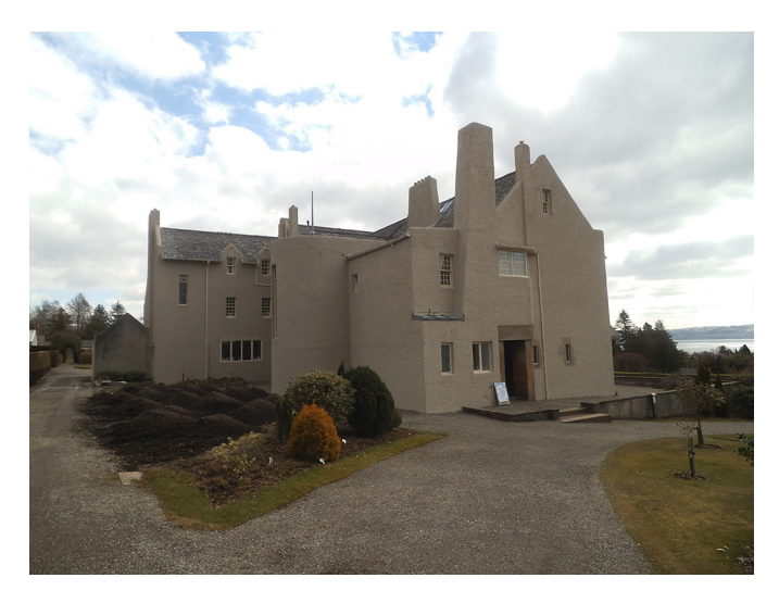
Fig. 6. The west façade and the entrance to the Hill House, Helensburgh, Argyll and Bute (C.R. Mackintosh, architect, 1904–5). This view was taken in 2013 some months after the exterior Portland Cement render had been painted to unify the appearance and improve resistance to environmental attack. The Clyde estuary can be seen in the background.

public access, something that the architect and heritage manager confirmed. Finally, we observe again that conservation and material scientists work in an arena where permissions, jurisdictions and different perspectives on the nature of a conservation problem co-exist. In this case, it is the values associated with heritage science itself, and the tensions that can arise between science and conservation, which are brought into sharp focus.