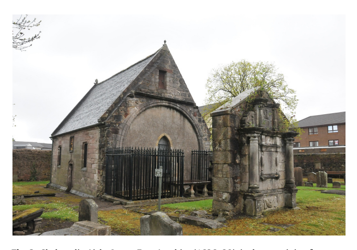
Fig. 3. Skelmorlie Aisle, Largs, East Ayrshire (1636–38), is the remaining fragment of a larger, now demolished, church. It now sits in a graveyard in the centre of Largs, enclosed by the surrounding wall and other buildings. Its highlight lies inside, the dramatically carved 17th C loft and mausoleum of the Montgomerie Family.

Furthermore, the case shows how specific forms of valuation are negotiated through the lens of different kinds of expertise. The attitudes, values and expectations of 'the public' are also important in this process, frequently projected by professionals as part of their valuations and debates. Scientific evidence is valued in itself as a justification for action, but the tendency to extract data in relation to a specific problem, a kind of 'snapshot' in the words of the conservation architect, is viewed with caution. Finally, it is evident from the data presented that while the professionals involved bring their own expertise and evaluations to the case, decision-making takes place in an institutional context, where the different authorities of the participants shape the evaluations involved.