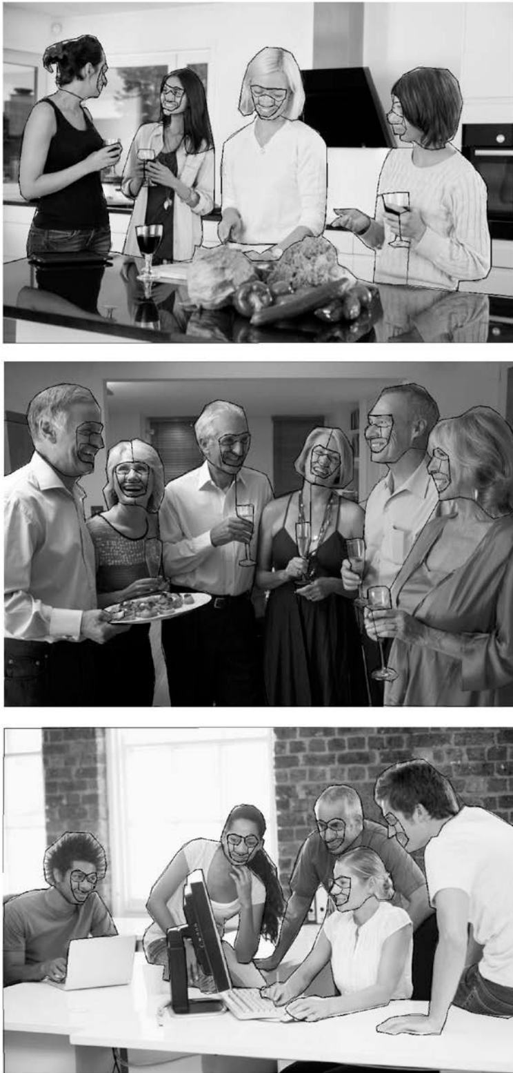
Figure 1. Example stimuli from Experiments 1 and 2. Black lines represent AOIs. In both experiments the images were displayed in colour.