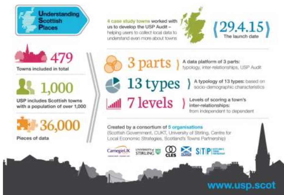
Figure 1 USP Infographic

USP introduces each place with a place descriptor. This is composed of a written paragraph based on the history, economy and location of the place and a descriptor generated from the other data on the web site. The written place descriptors differ from the traditional gazetteer approach. They are designed to be contemporary, using Street View and Google Earth as starting points to identify industrial parks and units, different housing areas and locational factors. In writing these as a set, or in reading them in groups, a picture of the wider networks which have impacted Scotland's towns could not be clearer.