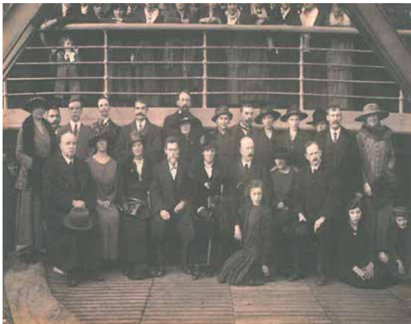
Departure of first contingent of Scottish Belgian Refugees to Belgium on SS Khyber from Hull, 16 December 1918

in England and Wales, while in Ireland these arrangements were conducted by the Irish LGB. However, the Scottish LGB which had devolved control over poor law and health matters did not play an equivalent role; that responsibility was taken by the Glasgow corporation committee.