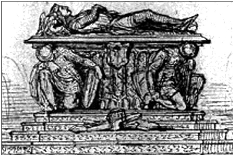
Plate 3: Sir Joseph Noël Paton's unfulfilled design for a monumental memorial over 'Bruce's tomb' in Dunfermline completed Abbey Church, c.1845. I am grateful to the National Galleries of Scotland for permission to reproduce this image [NGS D 4252/17].