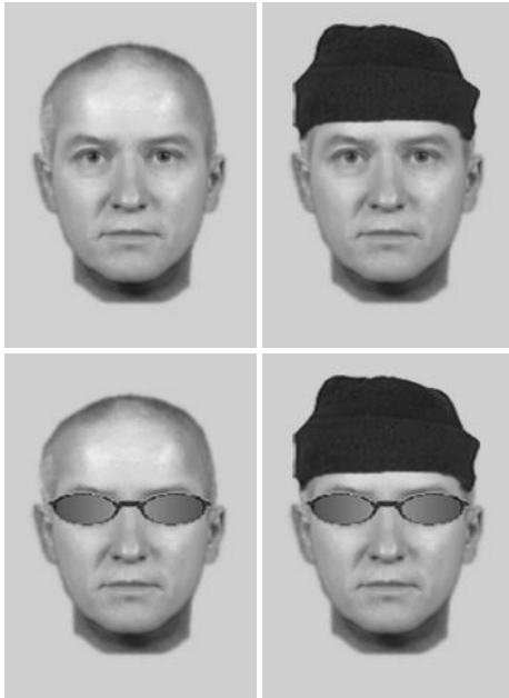
Fig. 3. Example composite constructed from memory by a participant in Experiment 3 of EastEnders' character Alfie Moon (played by actor Shane Richie), top left, and different representations, edited with selective concealments (woolly hat and sunglasses). Images were presented together as an array. In this example, the composite constructor initially saw a target photograph with inaccurate hair (a bald head in this case).