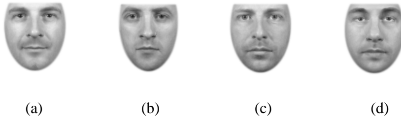
Fig. 1. Example internal-features composites constructed in Stage 1, 22-26 hours after the participant had seen: (a) an unaltered target, (b) a target wearing a hooded top, (c) a target with hair changed, and (d) an internal-features target. Composites were constructed to resemble UK football player, John Terry, and were used as part of the identification task in Stage 2. For reasons of copyright, we are unable to reveal the target photograph used, but a simple image search on the internet should easily reveal his appearance.