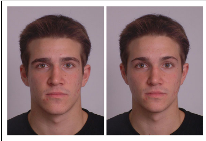
Figure 1. Examples of masculinized (left) and feminized (right) faces used in the study.

Following previous studies of dominance perceptions (e.g., Watkins et al., 2010), responses on the dominance perception test were coded using the following scale (which was centered on chance in the current study):