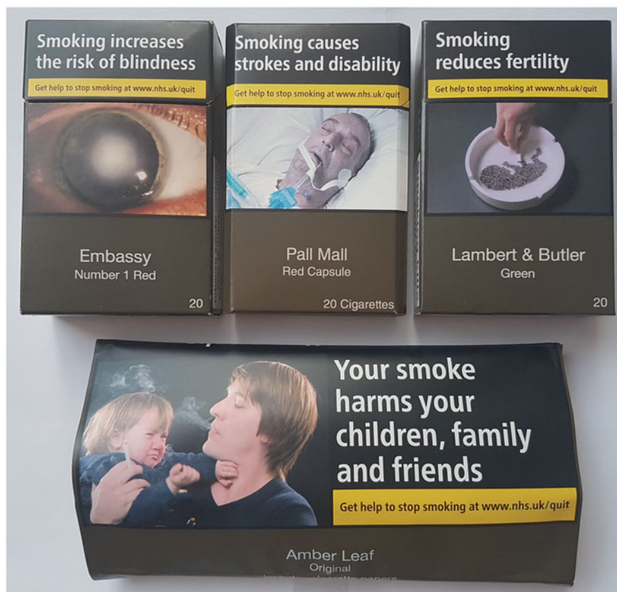
Figure 1. Standardised packs used in the survey.

Regulations (TRPR) requires pictorial warnings covering at least 65% of the principal display areas and text warnings on at least 50% of the secondary display areas. Prior to the legislation, in the UK a text warning covered 43% of the front, and a pictorial warning 53% of the back, of packs. The TRPR also requires the inclusion of cessation resource information (e.g. a stop-smoking helpline and/or web address) on each warning, with the UK Government opting to include a stop-smoking web address (Figure 1 shows standardised packaging in the UK).