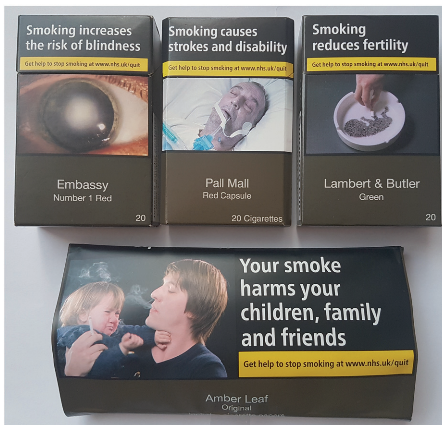
Figure 1. Standardised packs used in the survey.

Regulations (TRPR) requires pictorial warnings covering at least 65% of the principal display areas and text warnings on at least 50% of the secondary display areas. Prior to the legislation, in the UK a text warning covered 43% of the front, and a pictorial warning 53% of the back, of packs. The TRPR also requires the inclusion of cessation resource information (e.g. a stop-smoking helpline and/or web address) on each warning, with the UK Government opting to include a stop-smoking web address (Figure 1 shows standardised packaging in the UK).