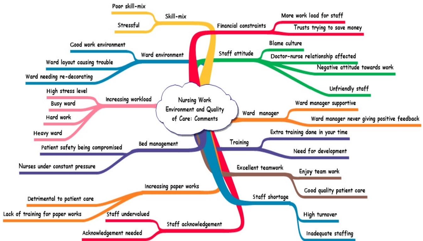
FIGURE 2 Creating categories phase