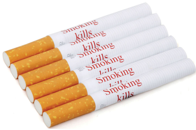
Figure 1. Warning on cigarettes.

to respond to questions at the start of each group, they were informed that their views may differ and when answering they should not be influenced by anyone else within the group or the interviewer(s). Groups typically lasted 90 minutes, after which participants were debriefed about the study and received an incentive fee (£25). Ethical approval was obtained from the Ethics Committee of the School of Management at the University of Stirling.