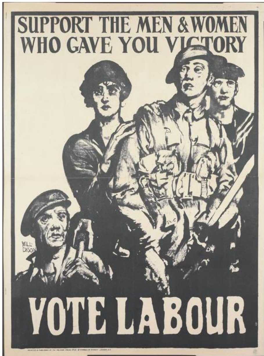
Fig. 5. 1918 Labour election poster. 149

As Jon Lawrence pointed out in his study of Wolverhampton politics, 'the ideal of progressive co-operation had not been wholly expunged' by the circumstances of the war and there is good evidence that the tradition of the 1903 Gladstone-MacDonald agreement did continue in the West Midlands. 150 Alfred Hazel stood down in West Bromwich, complaining that 'the Coalition wire-pullers are trying to effect the political