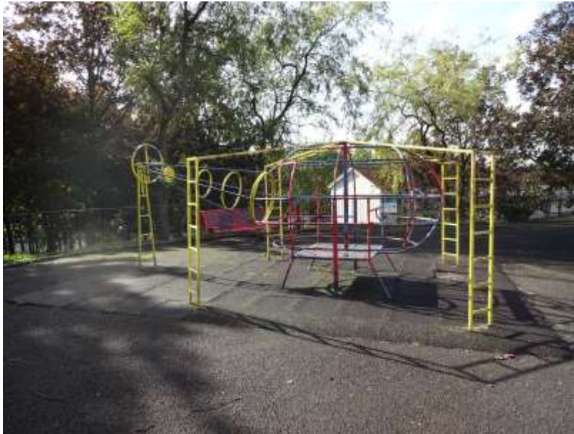
Figure 6: Playground at Moss Heights high flats, Glasgow, April 2016

In the 1990s and early 2000s we see echoes of the past and repeated shortcomings. While the planning of services and amenities moved into the realm of partnerships between public, quasi-public and third sector organisations, and community involvement was seen as central, communication was with adult representatives rather than children, despite international developments in children's rights and participation at this time. 70 The events-led approach to city wide regeneration also continued with the development of a city marketing bureau in 2004 to attract tourists, conferences and sports meetings to the city. 71 In this regard, selling Glasgow's image as the 'Dear Green Place' was important so that the upkeep and development of the city's main parks was perhaps the priority rather than caring for, or making, additional local provision for outdoor play. Access to such parks and open spaces was also very uneven and dependent on the ability to travel as determined by financial resources and the age of the child.