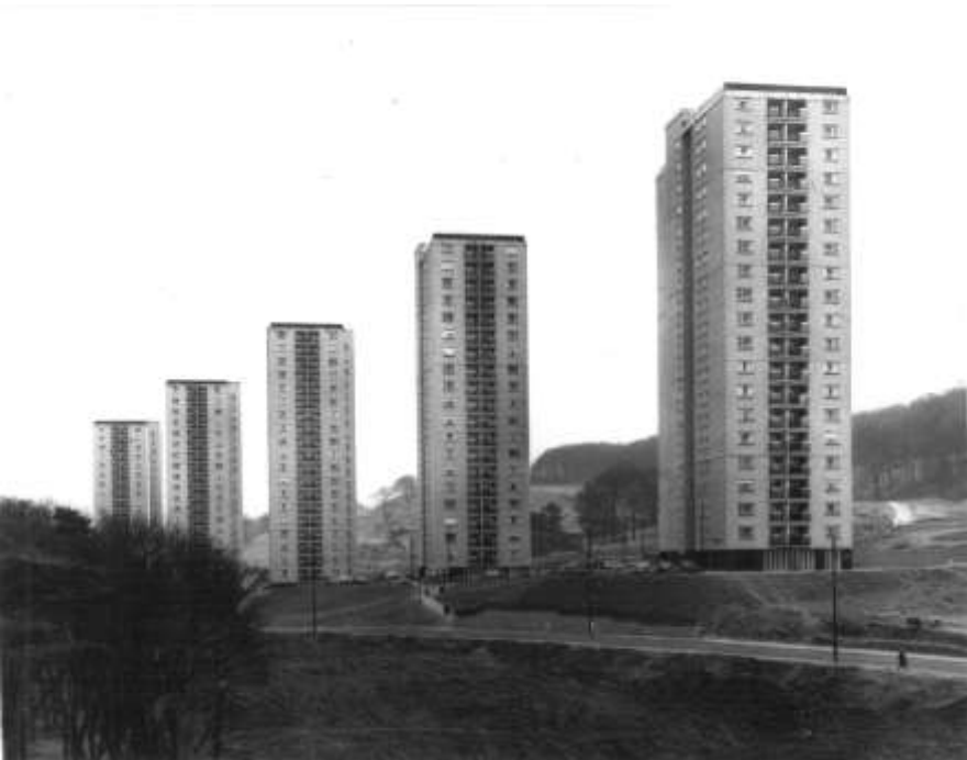
Figure 2: Mitchellhill Flats, Castlemilk (late 1960s)