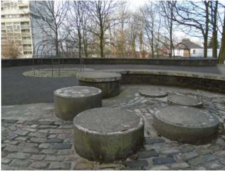
Figure 4: Playground at Broomhill high flats, Glasgow, June 2015