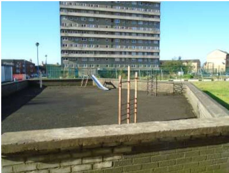
Figure 5: Playground at Cedar Court high flats, Glasgow, October 2015