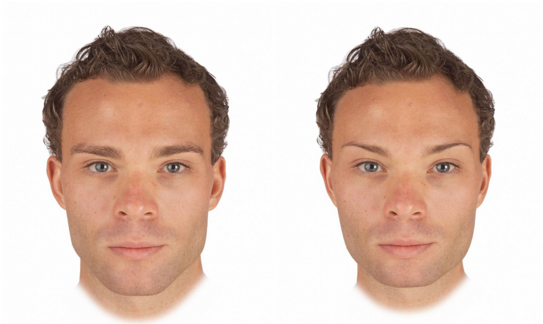
Figure 1. Examples of masculinized (left) and feminized (right) versions of men's faces used to assess facial masculinity preferences in our study.

Each participant completed two face preference tests (one assessing men's attractiveness for a short-term relationship, the other assessing men's attractiveness for a long-term relationship). Trial order within each test was fully randomized and the order in which the two face preference tests were completed was also fully randomized.